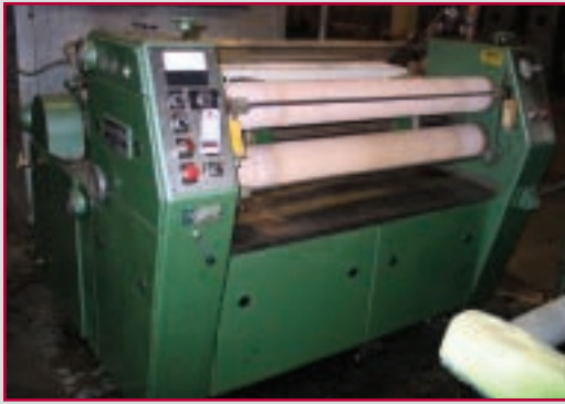
FABCON TUBULAR CALENDAR