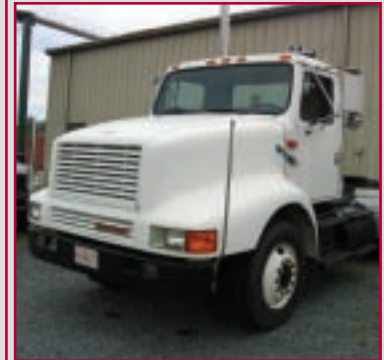
IH TRUCK TRACTOR