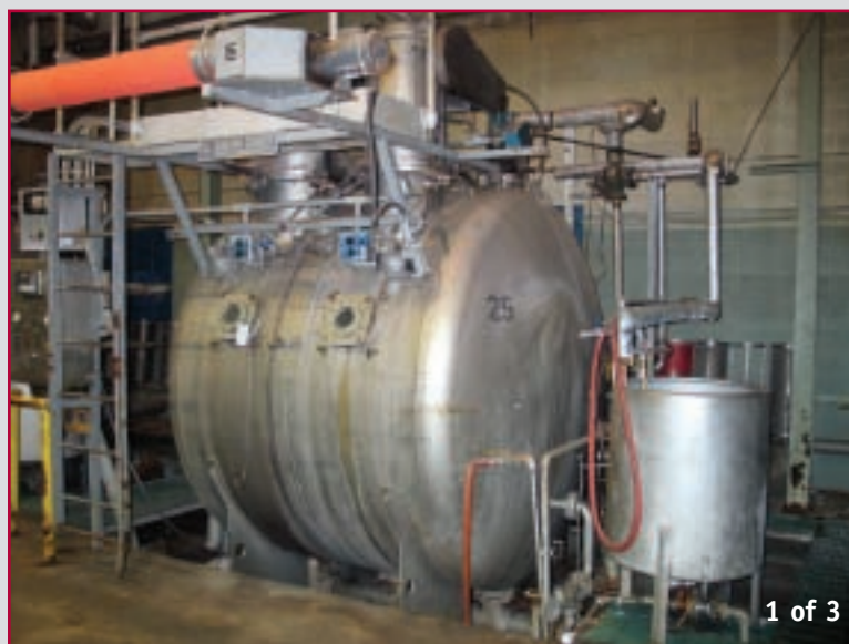
3 PORT JET DYER