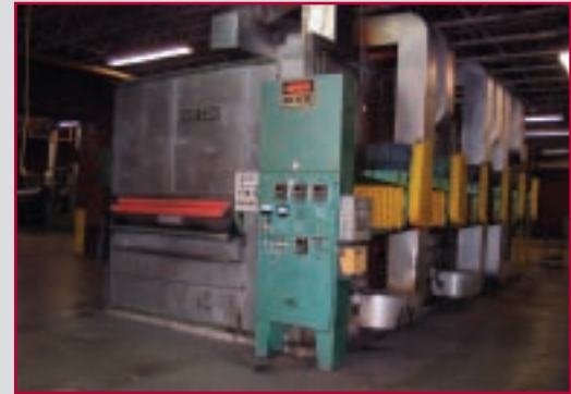
FABCON DRUM DRYER