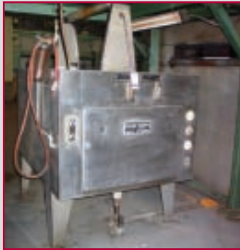
FABCON S.S STEAM CHAMBER