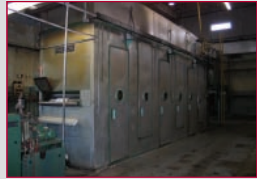
FABCON TUBULAR DRUM DRYER, S/N 81104