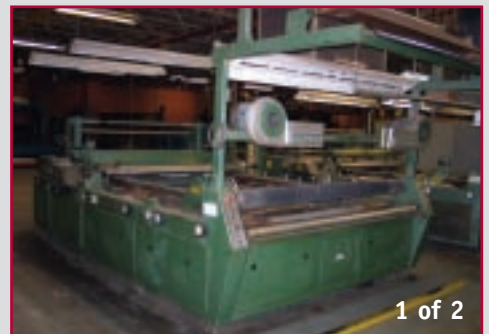
FABCON OPEN WIDTH TENTER