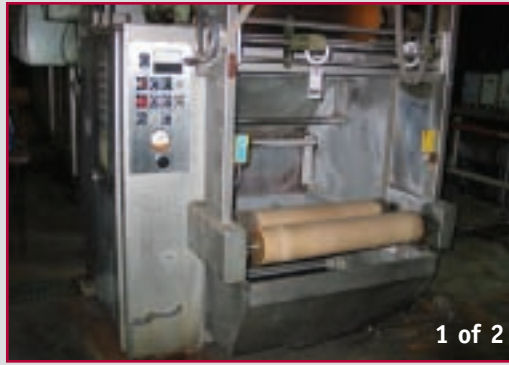
FABCON TUBULAR BALLOON PAD S/N 887