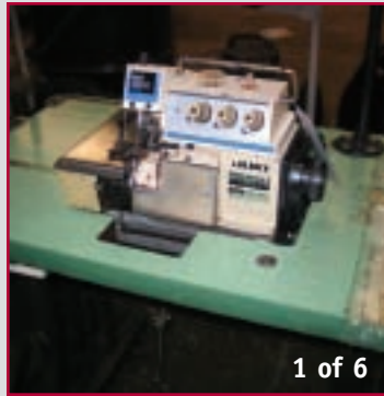
1 of 6