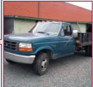
FORD F350 DUMP TRUCK