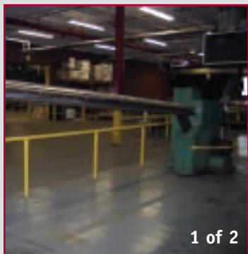
1 of 2