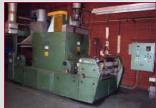
FABCON TUBULAR HEAT SETTER