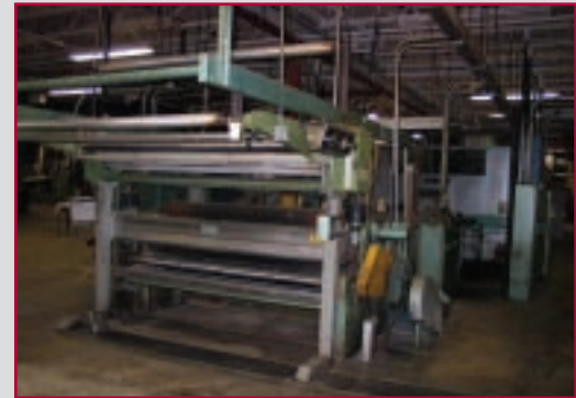
FABCON TENTER RANGE