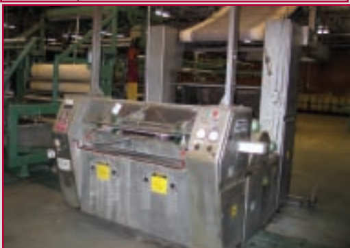
FABCON V-H PAD, S/N 9349