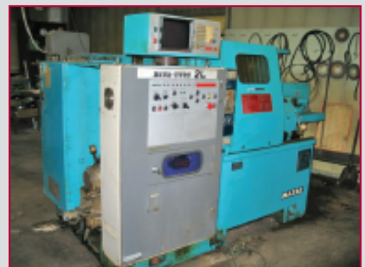
MAZAK CNC LATHE

IMPORTANT NOTICE: THE INFORMATION DESCRIBED IN THIS BROCHURE IS CORRECT TO THE BEST OF OUR KNOWLEDGE BUT WE CANNOT GUARANTEE SAME. IT IS FOR THIS REASON THAT BUYERS SHOULD AVAIL THEMSELVES OF THE OPPORTUNITY FOR INSPECTION PRIOR TO THE SALE.