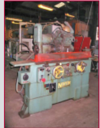
NORTON O.D. GRINDER