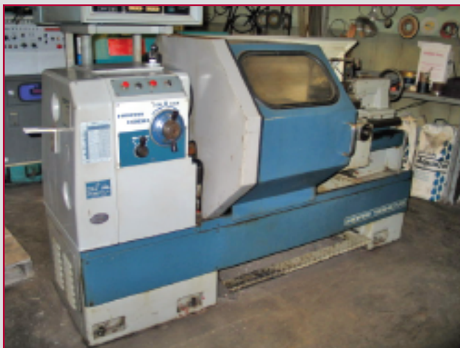
HOWA SANGLO CNC LATHE