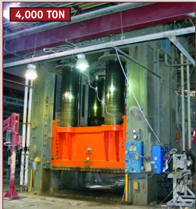
VERSON COMPRESSION MOLDING PRESS W/POWDER COATING SYSTEM