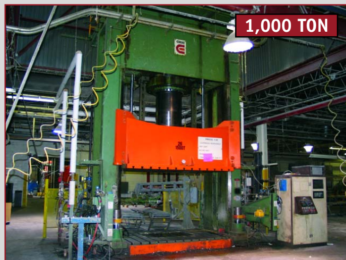
ERIE COMPRESSION MOLDING PRESS