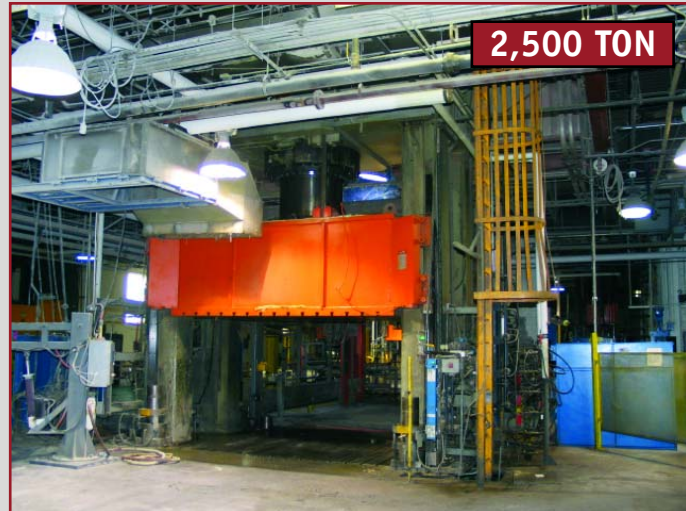
ERIE COMPRESSION MOLDING PRESS

APPLIED COMPOSITES CORP. AND DIVERSIFIED COMPOSITES CORP.