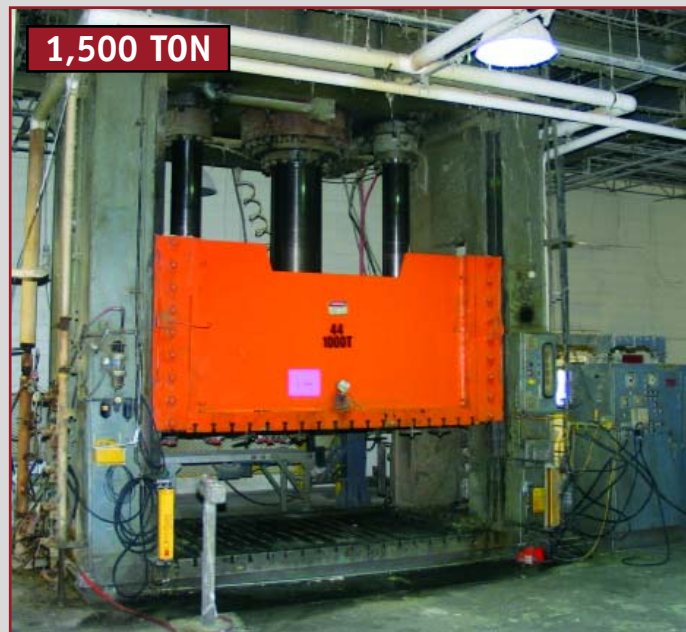
WILLIAMS & WHITE COMPRESSION MOLDING PRESS