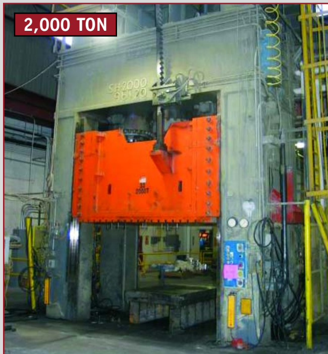
WILLIAMS & WHITE COMPRESSION MOLDING PRESS

INSPECTIONS: 10:00 A.M. TO 4:00 P.M. AT EACH LOCATION ON MONDAY, NOVEMBER 14 TH AND MORNING OF EACH SALE - 8:30 A.M. TO 10:30 A.M.