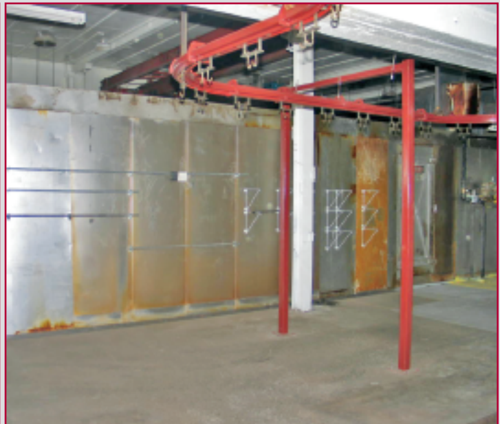
CURING & BATCH OVEN