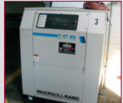
I.R. AIR COMPRESSOR

THE INFORMATION DESCRIBED IN THIS BROCHURE IS CORRECT TO THE BEST OF OUR KNOWLEDGE BUT WE CANNOT GUARANTEE SAME. IT IS FOR THIS REASON THAT BUYERS SHOULD AVAIL THEMSELVES OF THE OPPORTUNITY FOR INSPECTION PRIOR TO THE SALE.