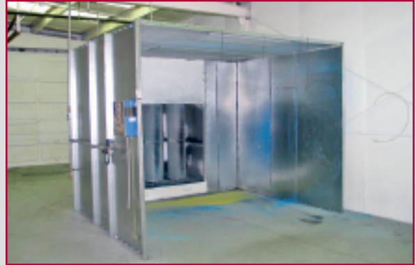
INDUSTRIAL BATCH SPRAY BOOTH