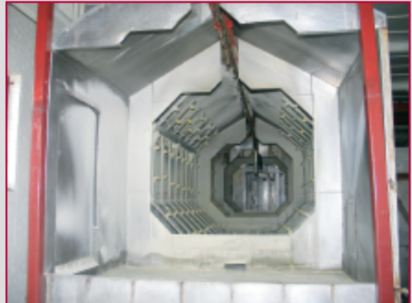
3 STAGE S.S. WASH STATION