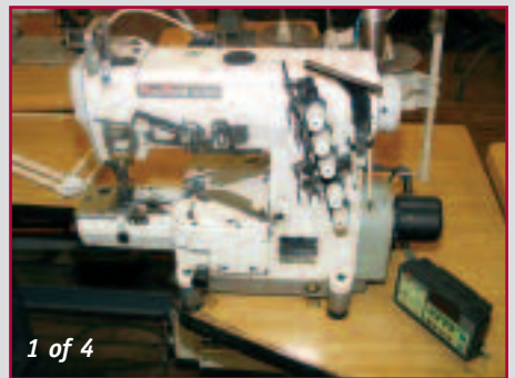
KANSAI RX-100 SEWING MACHINE