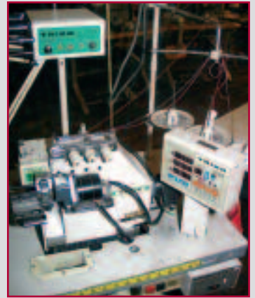
TAIKO 730C SEWING MACHINE