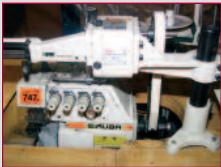
SIRUBA 747E SEWING MACHINE