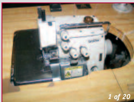
BROTHER B-531 SEWING MACHINE