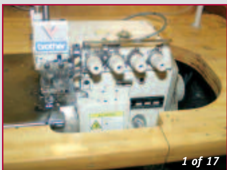
BROTHER V51 SEWING MACHINE