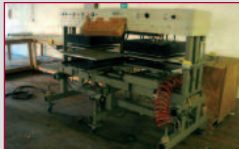
KNIGHT HEAT TRANSFER PRESS

MA Auc. Lic. #161 • Est. 1932 • PA Auc. Lic. #AU-0038-R