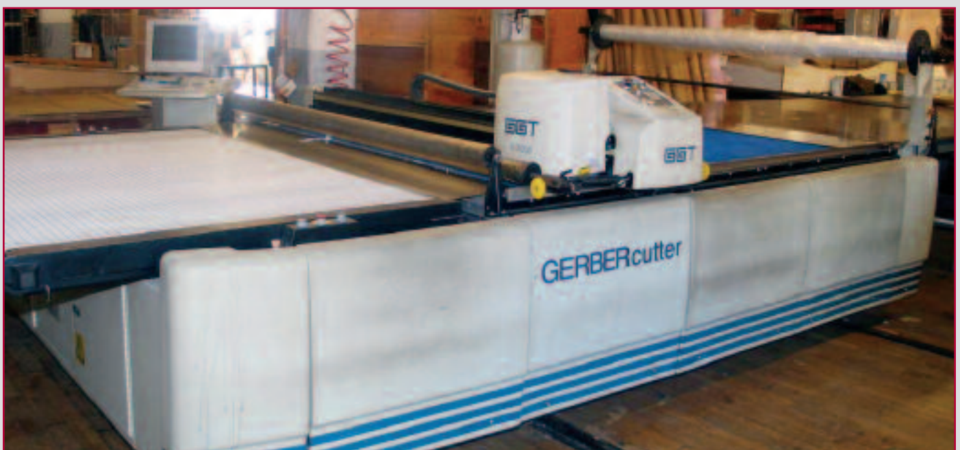
GERBER S-3200 CNC FABRIC CUTTER