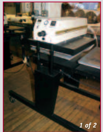
KNIGHT TRANSFER PRESS