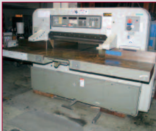
POLAR PAPER CUTTER