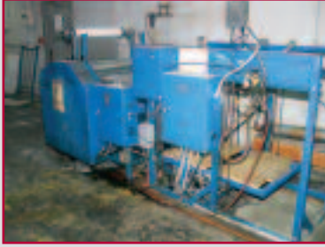
D&K FILM LAMINATOR