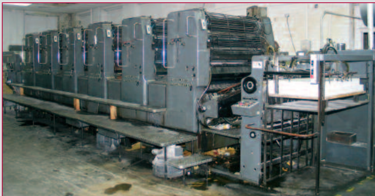
HEIDELBERG SPEEDMASTER 6 COLOR PRESS, MOD 102SP

INSPECTION: WEDNESDAY, OCTOBER 5TH – 10:00 A.M. TO 4:00 P.M. & MORNING OF SALE – 8:30 A.M TO 11:00 A.M.