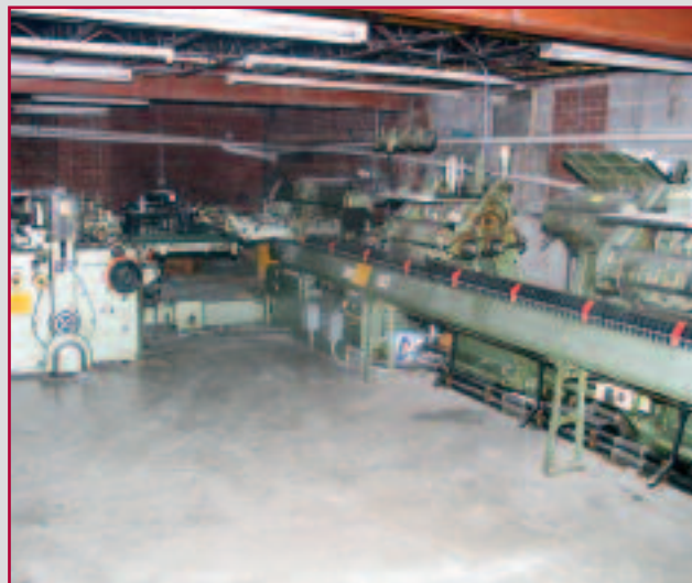
MUELLER MARTINI STITCHER