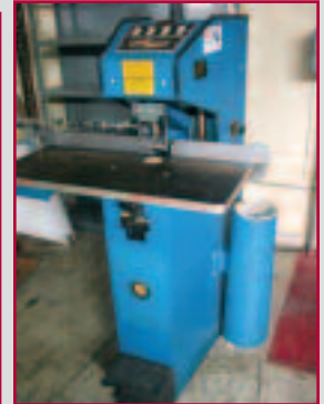
CHALLENGE PAPER DRILL