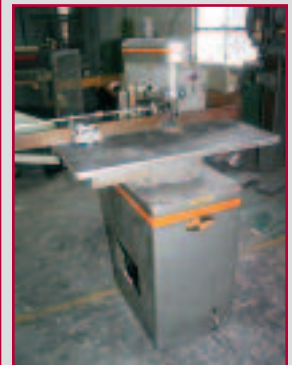
CHALLENGE PAPER DRILL