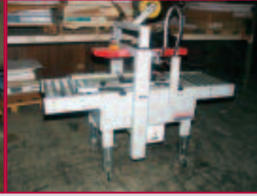
3M CASE SEALER