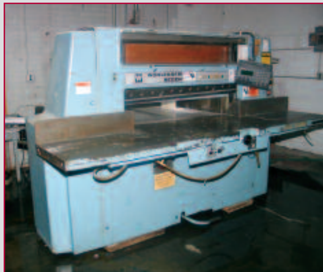
WOHLENBERG PAPER CUTTER