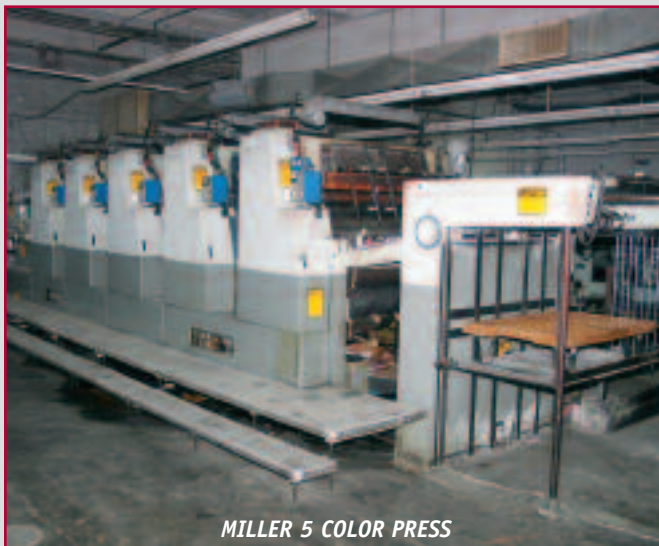
MILLER 5 COLOR PRESS

THURSDAY, OCTOBER 6 TH AT 11:00 A.M. DALTON, GEORGIA