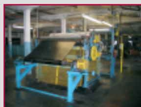
MOORE & WHITE SHEETER