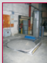
LANTECH PALLET WRAPPER