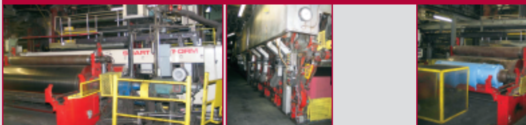
J.H. HORNE 100" TRIM