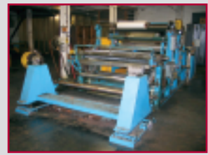
CUSTOM 66" LAMINATOR