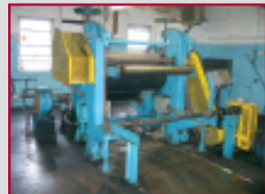
NORWOOD 44" EMOSSER