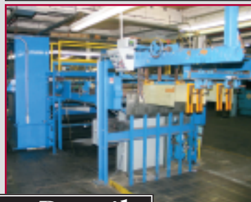
MARQUIS SHEETER LAMINATOR