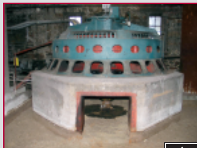
TURBINE HYDRO UNIT