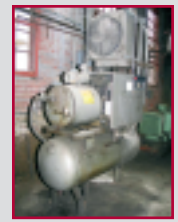
WORTHINGTON AIR COMPRESSOR