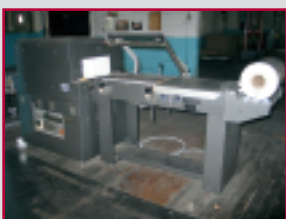
EASTEY HEAT SHRINK TUNNEL