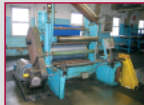
CUSTOM 44" EMOSSER