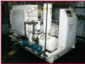
GARDNER-DENVER AIR COMPRESSOR