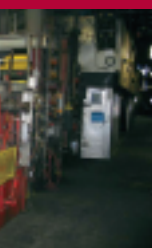
J.H. HORNE 80" TRIM