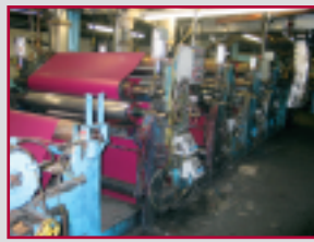
CUSTOM 4 COLOR PRINTING PRESS