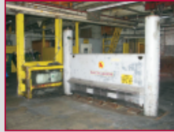
BLACK CLAWSON GUILLOTINE