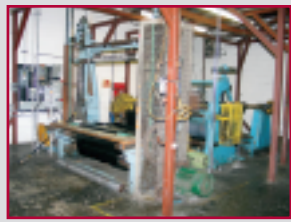
CAMERON 74" SLITTER/REWINDER