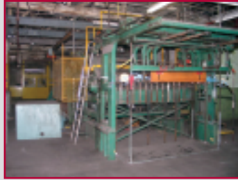
HAMBLET 84" SHEETER

THE INFORMATION DESCRIBED IN THIS BROCHURE IS CORRECT TO THE BEST OF OUR KNOWLEDGE BUT WE CANNOT GUARANTEE SAME. IT IS FOR THIS REASON THAT BUYERS SHOULD AVAIL THEMSELVES OF THE OPPORTUNITY FOR INSPECTION PRIOR TO THE SALE.