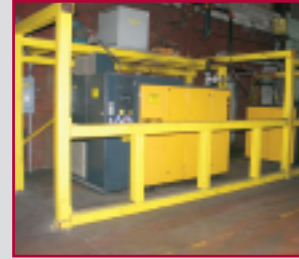
KAESER AIR COMPRESSOR