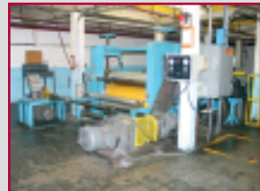
SERVICE MACHINE 64" EMOSSER