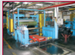
CAMERON 60" SLITTER