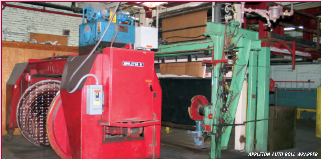
APPLETON AUTO ROLL WRAPPER

INSPECTIONS: 10:00 A.M. TO 4:00 P.M. AT EACH LOCATION ON DAY PRIOR TO EACH SALE AND MORNING OF SALE – 8:30 A.M. TO 10:30 A.M. AT EACH LOCATION