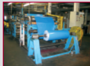
CUSTOM 50" LAMINATOR