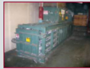
INT'L HORIZONTAL BALER