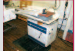
VEIT VACUUM IRON STATION