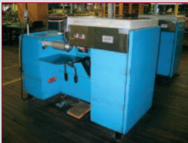
AMF STITCHING MACHINE