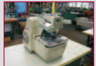
REECE SEWING MACHINE