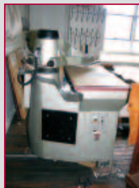
EMHART DIE CUTTER