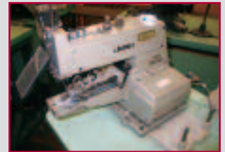
JUKI SEWING MACHINE