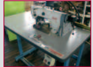
AMF REECE SEWING MACHINE