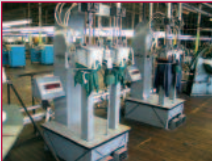
HOFFMAN COMPUTERIZED PRESS