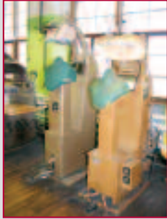
HOFMAN COLLAR PRESSES