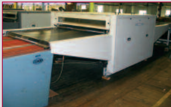
ASTECHNOLOGIES FLOW THRU FUSING MACHINE