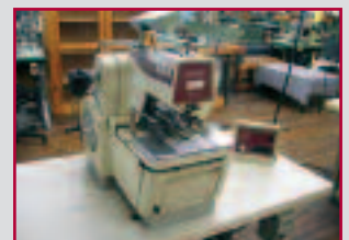
REECE SEWING MACHINE