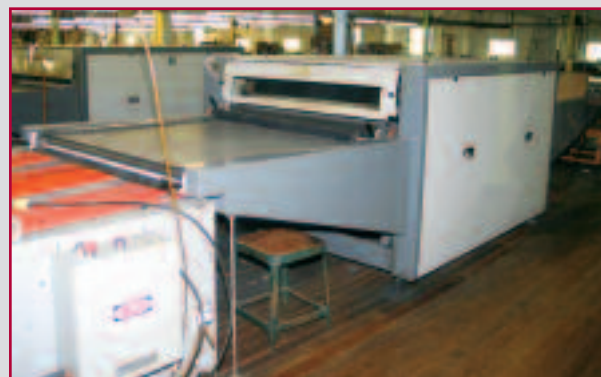
ASTECHNOLOGIES FLOW THRU FUSING MACHINE