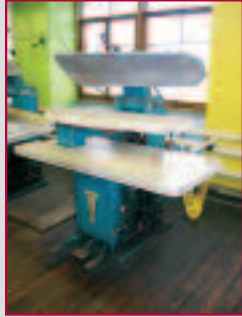
NY STEAM PRESS