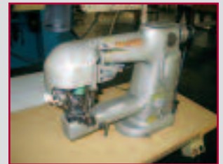
STROBEL SEWING MACHINE