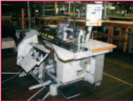
DURKOPP POCKET CUTTER