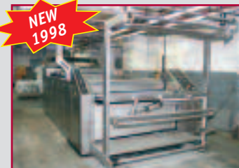
TMT WET BRUSH