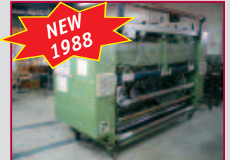
JOHANNES MENSCHER WEFT STRAIGHTENER