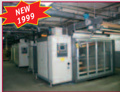
MARIO CROSTA NAPPING & SHEARING LINES