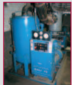
QUINCY VACUUM PUMP