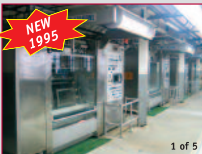
MAT DIBERTOLI FULLING & SCOURING MACHINE