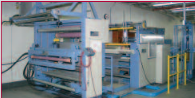
1997 ATF ROLLING & WRAPPING MACHINE