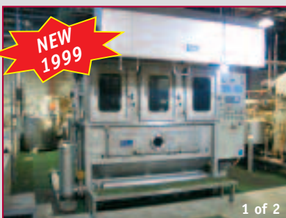
LAIP 3 TUBE JET DYE MACHINE