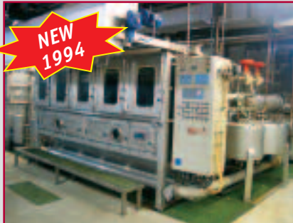
LAIP 5 TUBE DYE MACHINE