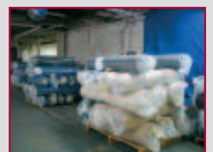
PARTIAL VIEW OF INVENTORY