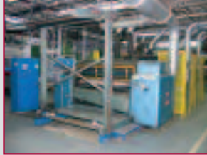
PARKS & WOOLSON SHEARING MACHINE