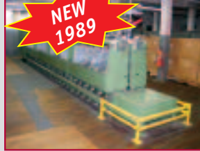
SAUER ALLMA TWISTER