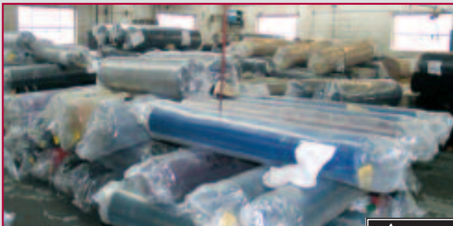
PARTIAL VIEW OF INVENTORY

LIVE ONSITE & LIVE INTERNET BIDDING AVAILABLE AT WWW.POSNIKLIVE.COM