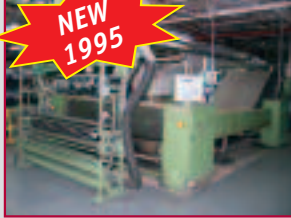
SPERROTO RIMAR STEAMER