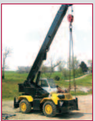
P&H TRUCK CRANE