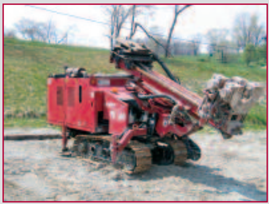
2002 EGT VD500 DRILL RIG