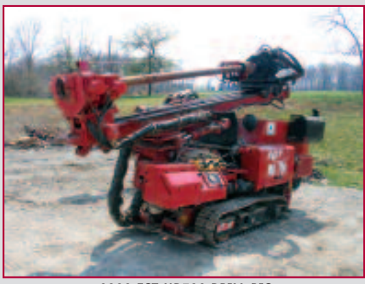
2002 EGT MD700 DRILL RIG