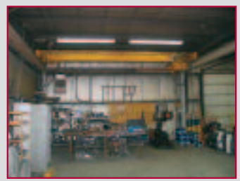
3 TON BRIDGE CRANE