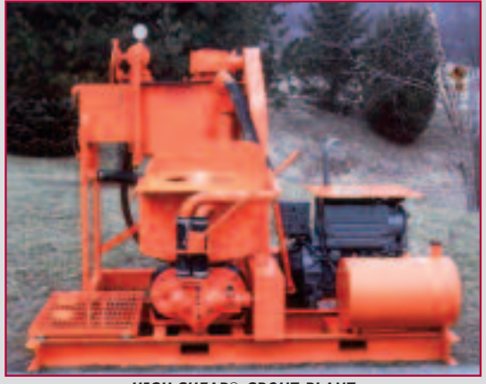
HIGH SHEAR® GROUT PLANT