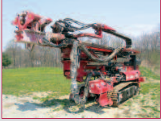
2002 EGT MD3000 DRILL RIG