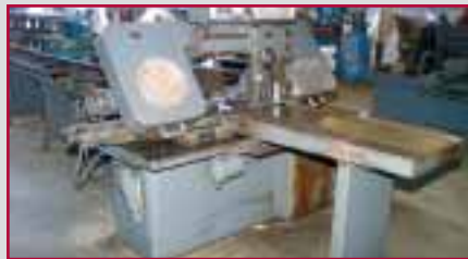
DOALL HORIZONTAL BAND SAW