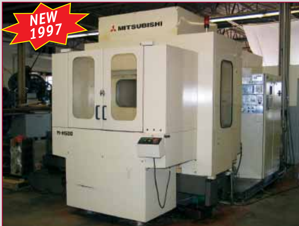
MITSUBISHI M-H500 MACHINING CENTER