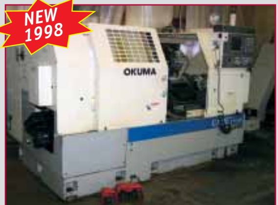
OKUMA CNC LATHE