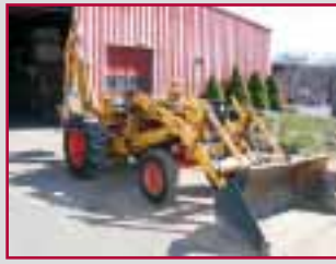
CASE LOADER BACKHOE