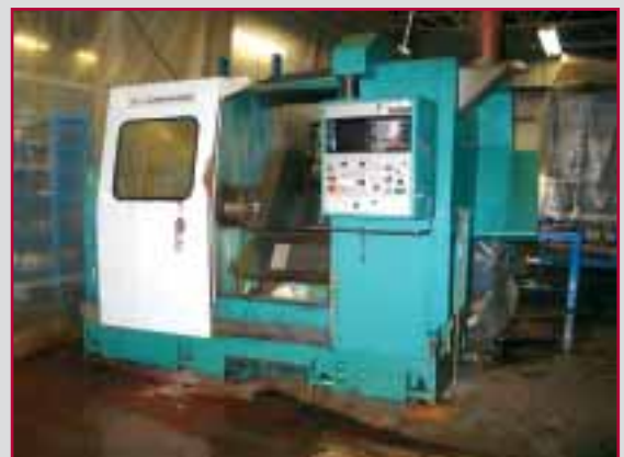
NAKAMURA CNC LATHE