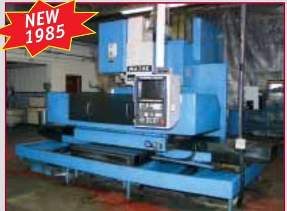
MAZAK CNC VERTICAL MACHINING CENTER