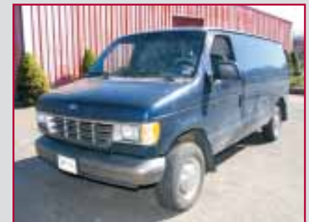
1993 FORD CARGO VAN