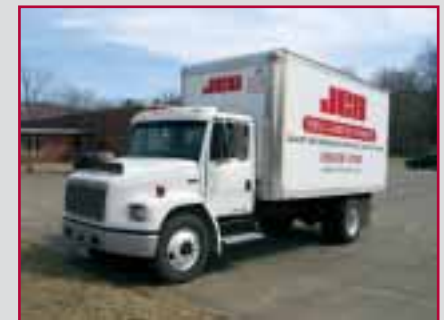
1998 FREIGHTLINER BOX TRUCK