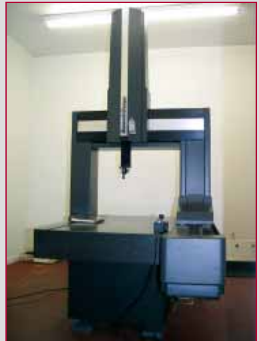
B&S COORDINATE MEASURING MACHINE

MA Auc. Lic. #161 • Est. 1932 • PA Auc. Lic. #AU-0038-R