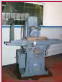
ABRASIVE SURFACE GRINDER