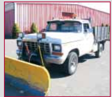
1979 FORD DUMP TRUCK