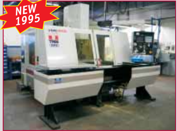
TREE CNC VERTICAL MACHINING CENTER

THE INFORMATION DESCRIBED IN THIS BROCHURE IS CORRECT TO THE BEST OF OUR KNOWLEDGE BUT WE CANNOT GUARANTEE SAME. IT IS FOR THIS REASON THAT BUYERS SHOULD AVAIL THEMSELVES OF THE OPPORTUNITY FOR INSPECTION PRIOR TO THE SALE.