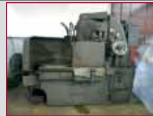
BLANCHARD SURFACE GRINDER