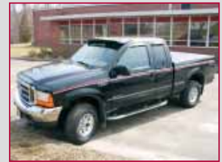
2001 FORD PICKUP TRUCK