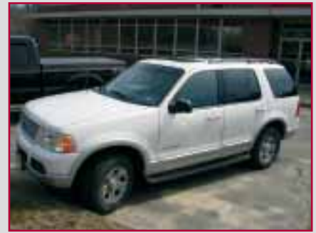
2002 FORD EXPLORER SUV