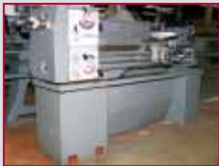
EMS ENGINE LATHE