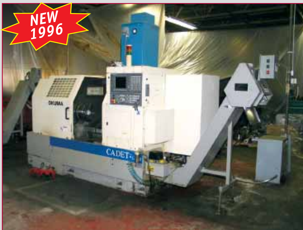
OKUMA CADET L1420 CNC LATHE