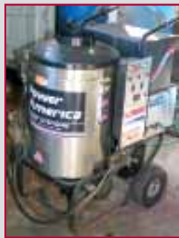
POWER STEAM CLEANER