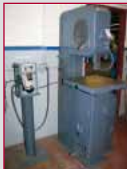
DOALL VERTICAL BAND SAW