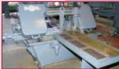
DOALL HORIZONTAL BAND SAW