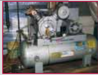
I.R. AIR COMPRESSOR