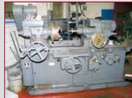
HEALD I.D. GRINDER