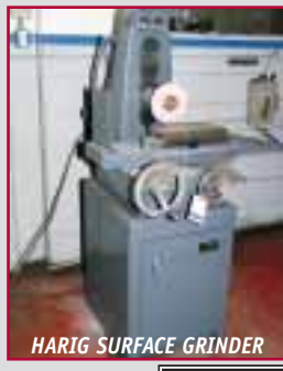
HARIG SURFACE GRINDER