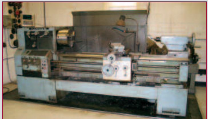
TARNOW ENGINE LATHE