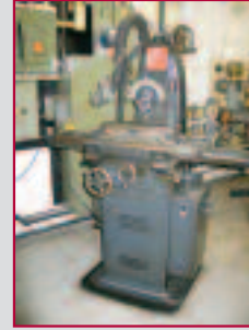
BROWN & SHARPE SURFACE GRINDER