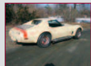
1975 CHEVY CORVETTE STINGRAY