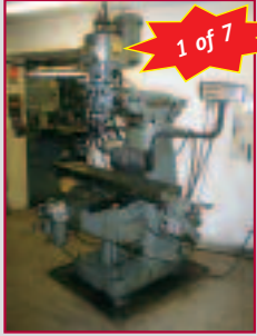
BRIDGEPORT VERTICAL MILLER