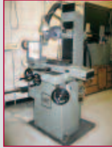
MHT SURFACE GRINDER