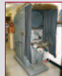
BAUSCH & LOMB OPTICAL COMPARATOR