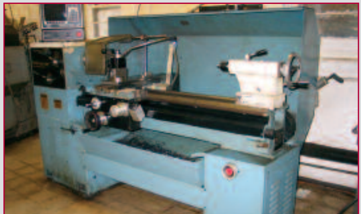
TRAK ENGINE LATHE