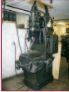
MOORE JIG GRINDER