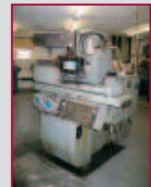
BROWN & SHARPE SURFACE GRINDER