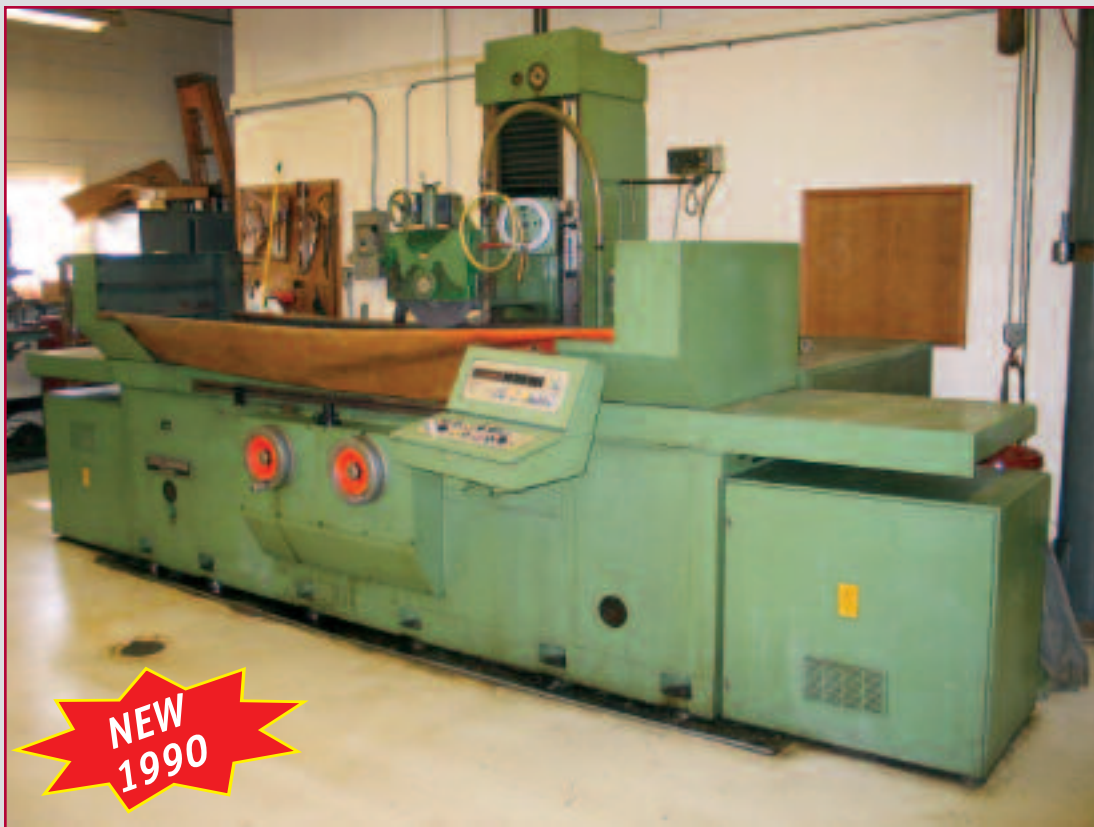
LIVHICA KIKINDA SURFACE GRINDER

INSPECTION: WEDNESDAY, MAY 4 TH – 10:00 A.M. TO 4:00 P.M. AND MORNING OF SALE – 8:30 A.M TO 10:30 A.M.