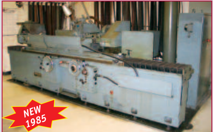
LIVHICA KIKINDA CYLINDRICAL

THE INFORMATION DESCRIBED IN THIS BROCHURE IS CORRECT TO THE BEST OF OUR KNOWLEDGE BUT WE CANNOT GUARANTEE SAME. IT IS FOR THIS REASON THAT BUYERS SHOULD AVAIL THEMSELVES OF THE OPPORTUNITY FOR INSPECTION PRIOR TO THE SALE.