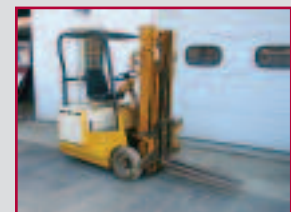
AUTOMATIC ELECTRIC FORKLIFT