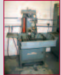
SUNNEN HONING MACHINE

★ Lg. Qty. Round, Flat & Bar Steel Stock ★