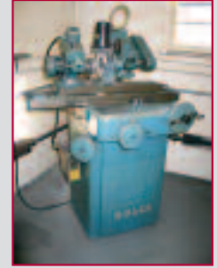
K.O. LEE CUTTER GRINDER