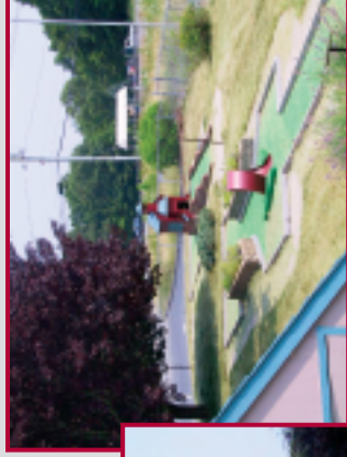
18 HOLE MINIATURE GOLF