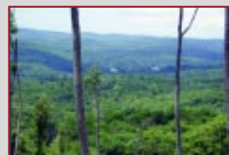
VIEW FROM SUMMIT LOOKING NORTH