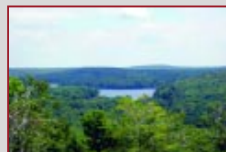
VIEW FROM SUMMIT LOOKING SOUTH