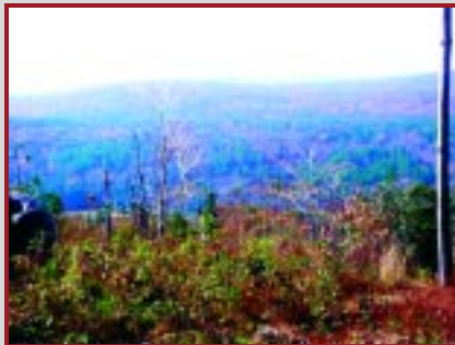
360° MOUNTAIN TOP VIEWS