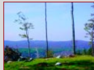
VIEW FROM SUMMIT LOOKING WEST