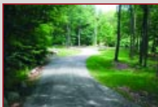
VIEW OF DRIVEWAY