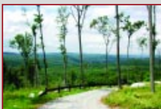
MIDWAY TO SUMMIT