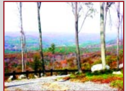
360° MOUNTAIN TOP VIEWS

Visit our website www.posnik.com for Bidder's Informational Package.