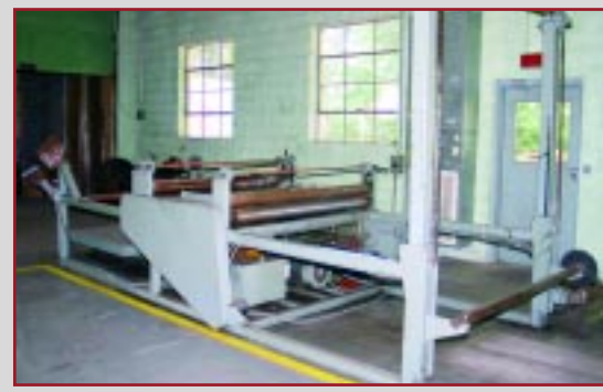
WESTERN 62" SLITTER