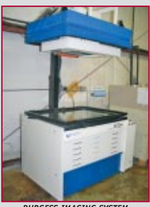
BURGESS IMAGING SYSTEM