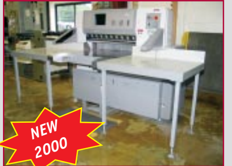
POLAR PAPER CUTTER

• ASTRO PORT. ENVELOPE FEEDER, M/N AMC-2000 W/ CONVEYOR FEEDER • • CHALLENGE SINGLE SPINDLE HYD. PAPER DRILL, MOD. CENTURY, S/N 64073 CHALLENGE HYD. CORNERING MACH., MOD. SCM, S/N 1228 • ROSBACK MULTI-HEAD STITCHER, 1 PH. • BERKSHIRE WESTWOOD 32" PLATE PROCESSOR, M/N D32, S/N 1311/T4 •