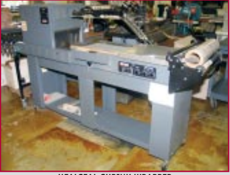
HEALSEAL SHRINK WRAPPER