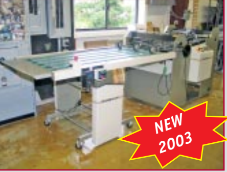
ROSBACK 240XL PERFORATOR