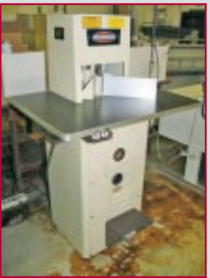
CHALLENGE CORNERING MACHINE