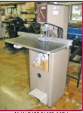
CHALLENGE PAPER DRILL