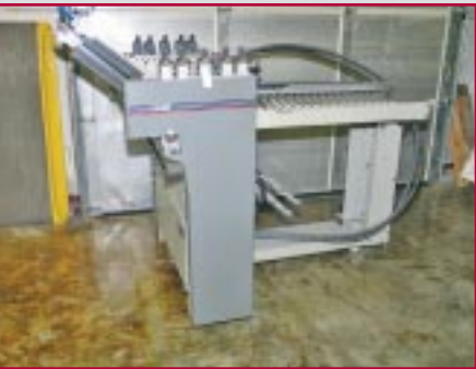
BAUM RIGHT ANGLE ATTACHMENT