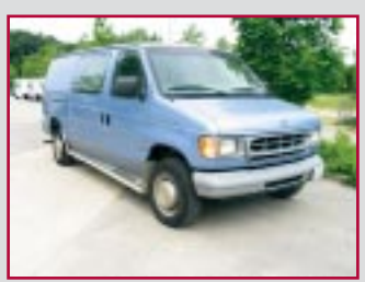
1997 FORD ECONOLINE 250 VAN