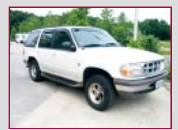
1996 FORD XLT EXPLORER