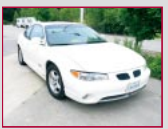
1998 PONTIAC GRAND PRIX