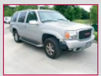
1999 GMC YUKON DANALI