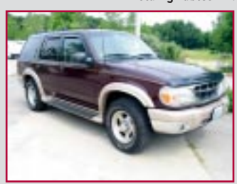
2000 FORD EDDIE BAUER EXPLORER