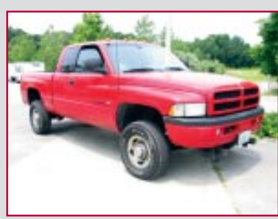
1998 DODGE RAM 2500 PICKUP