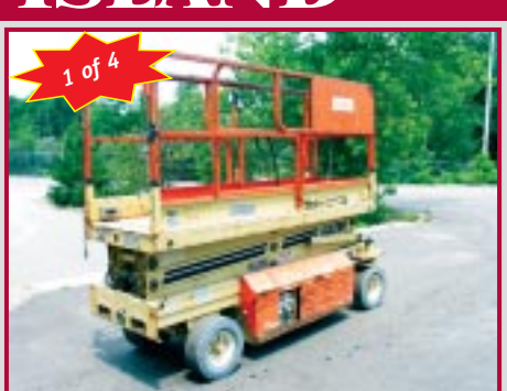
JLG SCISSOR LIFT

Est. 1932 MA Auc. Lic. #161 • PA Lic. #AU-0038-R