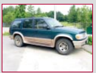
1996 FORD EDDIE BAUER EXPLORER