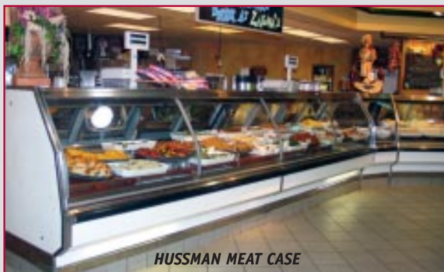
HUSSMAN MEAT CASE

INSPECTION: MORNING OF SALE - 8:30 A.M TO 10:30 A.M.