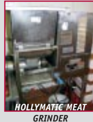
HOLLYMATIC MEAT GRINDER