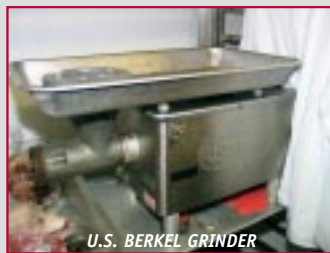
U.S. BERKEL GRINDER