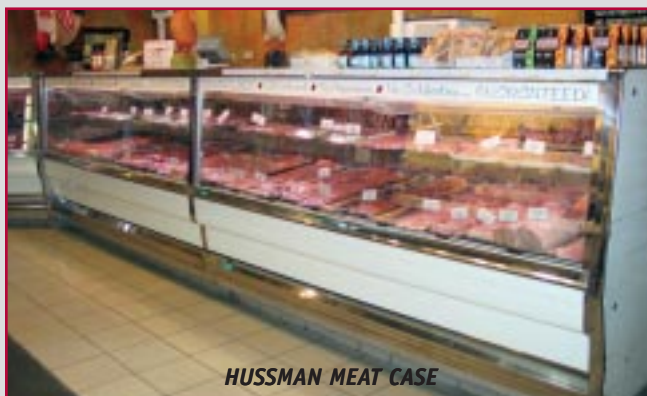
HUSSMAN MEAT CASE