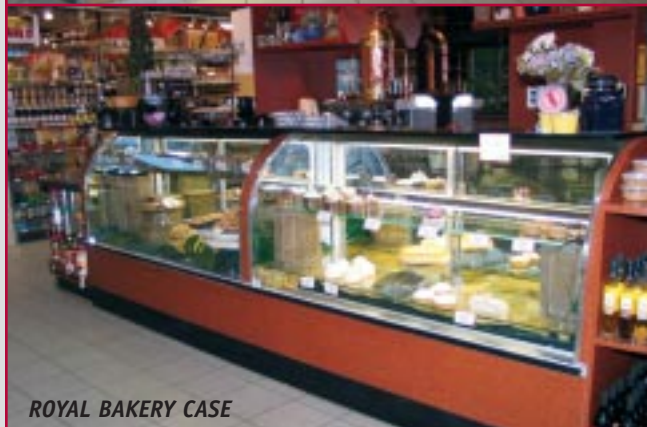
ROYAL BAKERY CASE