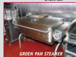
GROEN PAN STEAMER