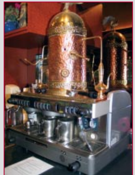
LaCIMBALI CAPPUCCIN MACHINE