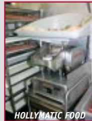
HOLLYMATIC FOOD PORTIONER