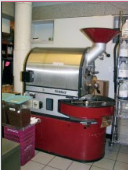
PROBAT COFFEE ROASTER