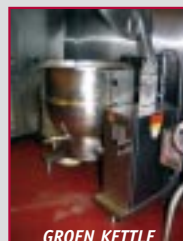
GROEN KETTLE STEAMER