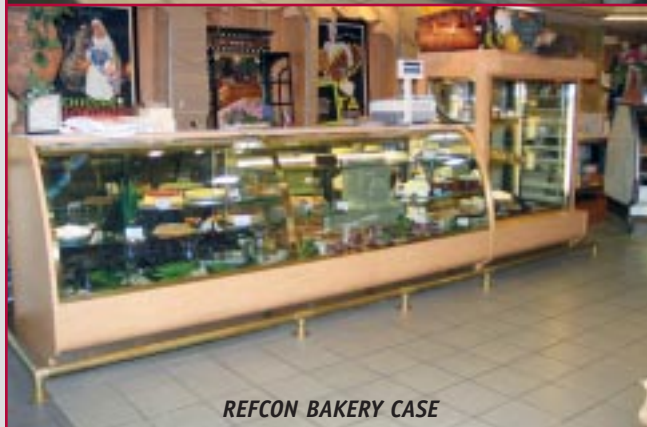
REFCON BAKERY CASE