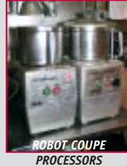
ROBOT COUPE PROCESSORS