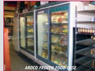
ARDCO FROZEN FOOD CASE