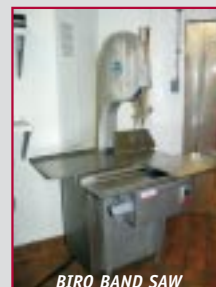
BIRO BAND SAW