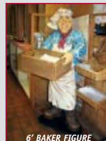
6' BAKER FIGURE