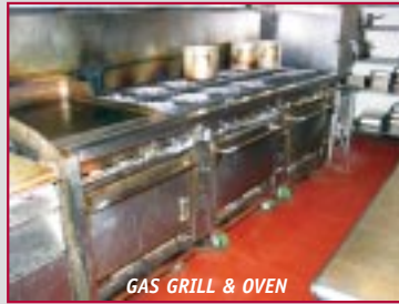
GAS GRILL & OVEN