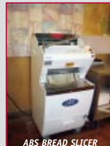
ABS BREAD SLICER