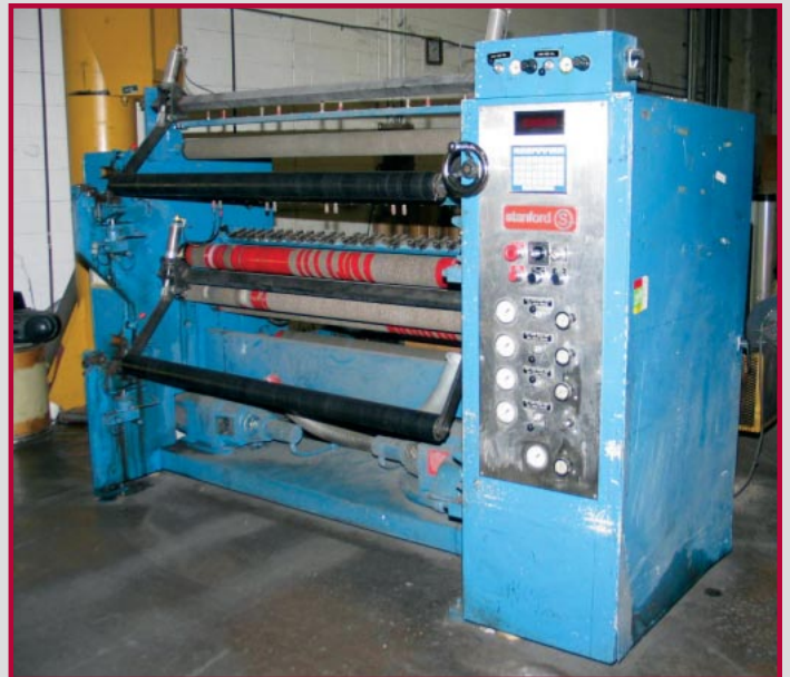
STANFORD 62" SLITTER-REWINDER