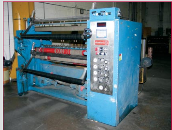
STANFORD 62" SLITTER-REWINDER