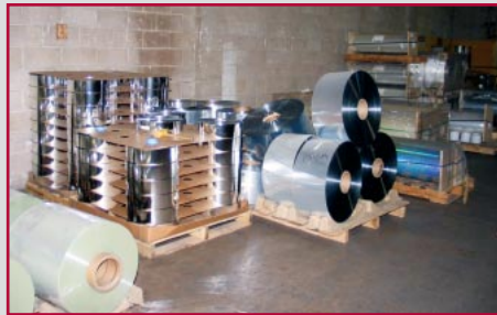
PARTIAL VIEW OF INVENTORY