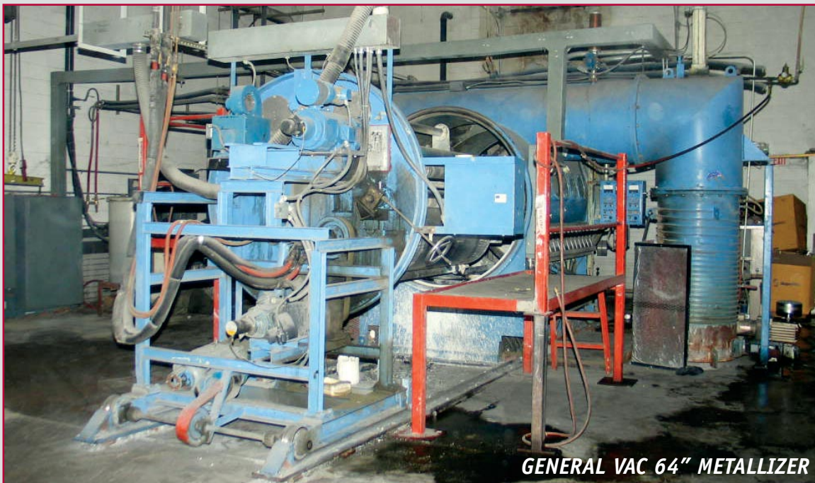
GENERAL VAC 64" METALLIZER

INSPECTION: WEDNESDAY, MAY 26 TH - 10:00 A.M. - 4:00 P.M. AT EACH LOCATION & DAY OF SALE STARTING AT 8:30 A.M AT EACH LOCATION