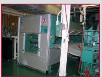
FEHRER NL21 NEEDLE LOOM