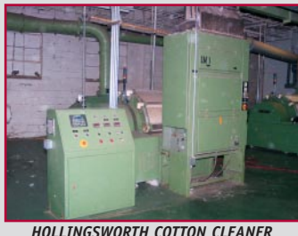
HOLLINGSWORTH COTTON CLEANER