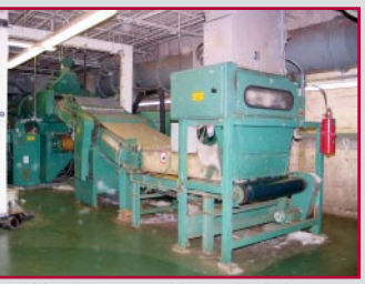
COMPUTERIZED CONVEYOR SYSTEM