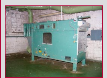
TAMAFA BALE OPENER

AIR LAID NONWOVEN LINE W/ NEEDLE LOOMS CONSISTING OF: • FEHRER NL21 NEEDLE LOOM, 3.3 METERS WIDE, S/N 424 (NEW 1997) • • FEHRER NL9 TACKER NEEDLE LOOM, 3.3 METERS WIDE, S/N 344 (NEW 1997) • • FEHRER 134" RISING ROLL BATCH WINDER, M/N W3.3M, S/N 317 • • FEHRER 134" RISING ROLL BATCH WINDER, M/N W3.3M, S/N 317 • • FEHRER 134" RISING ROLL BATCH WINDER, M/N W3.3M, S/N 317 • • FEHRER K12 WEB FORMER W/ TIRE LOFT DEVKE (NEW 1989) • • FEHRER K12 WEB FORMER W/ TIRE LOFT DEVKE (NEW 1989) • • FEHRER H1-LOFT DEVICE (NEW RETROFIT TO K-12 1997) • • FEHRER PRE WEB FORMER, M/N V21-3.2M, S/N 242 (NEW 1989) •