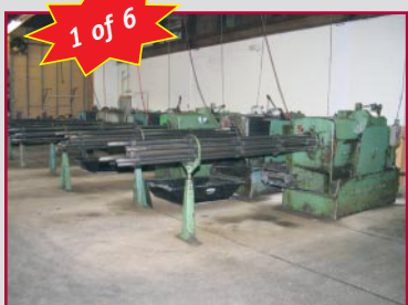
NEW BRITAIN #61 SCREW MACHINE