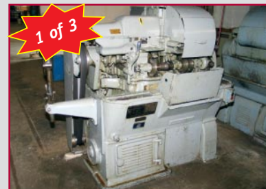
B & S OG SCREW MACHINE