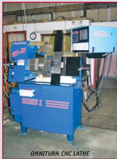
OMNITURN CNC LATHE

THE INFORMATION DESCRIBED IN THIS BROCHURE IS CORRECT TO THE BEST OF OUR KNOWLEDGE BUT WE CANNOT GUARANTEE SAME. IT IS FOR THIS REASON THAT BUYERS SHOULD AVAIL THEMSELVES OF THE OPPORTUNITY FOR INSPECTION PRIOR TO THE SALE.