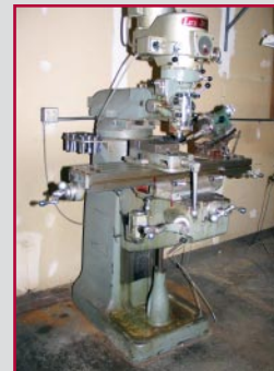
LUX MILL MILLER