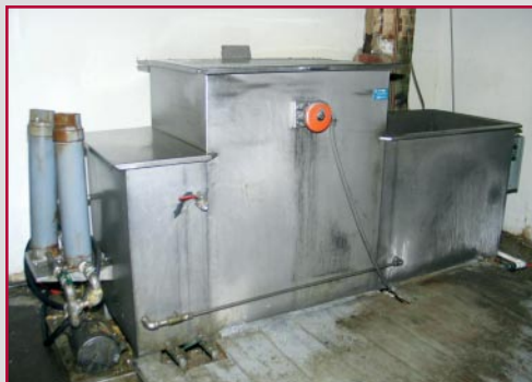
GRECO RINSE STATION