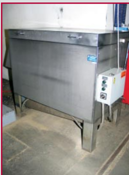
GRECO AUTO DRYER