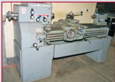
LEBLOND ENGINE LATHE