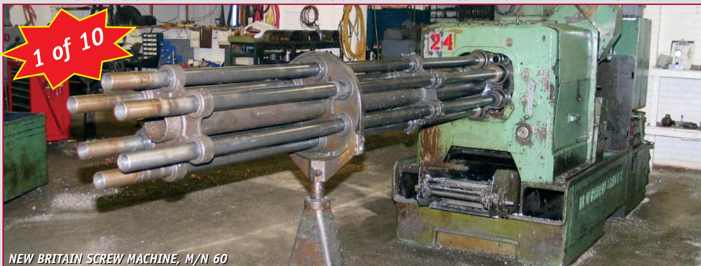
NEW BRITAIN SCREW MACHINE, M/N 60