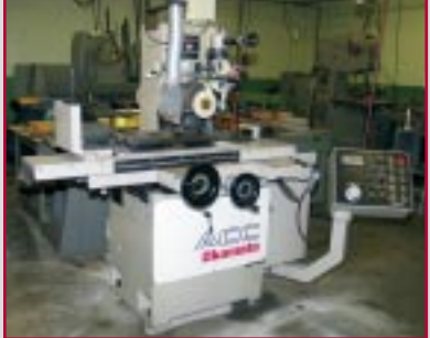
OKAMOTO SURFACE GRINDER