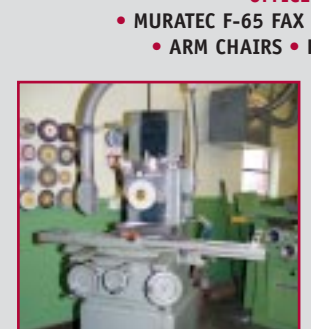
REID SURFACE GRINDER