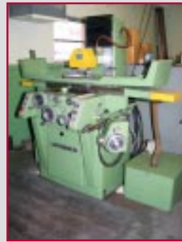
JAKOBSEN SURFACE GRINDER

HONING MACHINE • SUNNEN PRECISION HONING MACHINE, M/N MBB-1600, S/N 45737, 1/2 H.P., 1 PH.