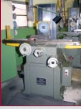
WCI SURFACE GRINDER