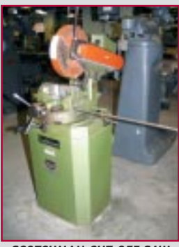
SCOTCHMAN CUT-OFF SAW