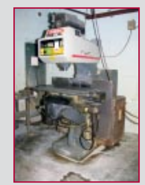
BRIDGEPORT CNC SERIES I