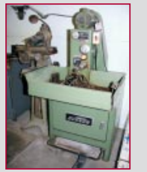
SUNNEN HONING MACHINE