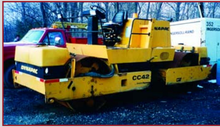
1985 DYNAPACK COMPACTOR