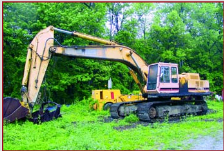
YUTANI CRAWLER EXCAVATOR