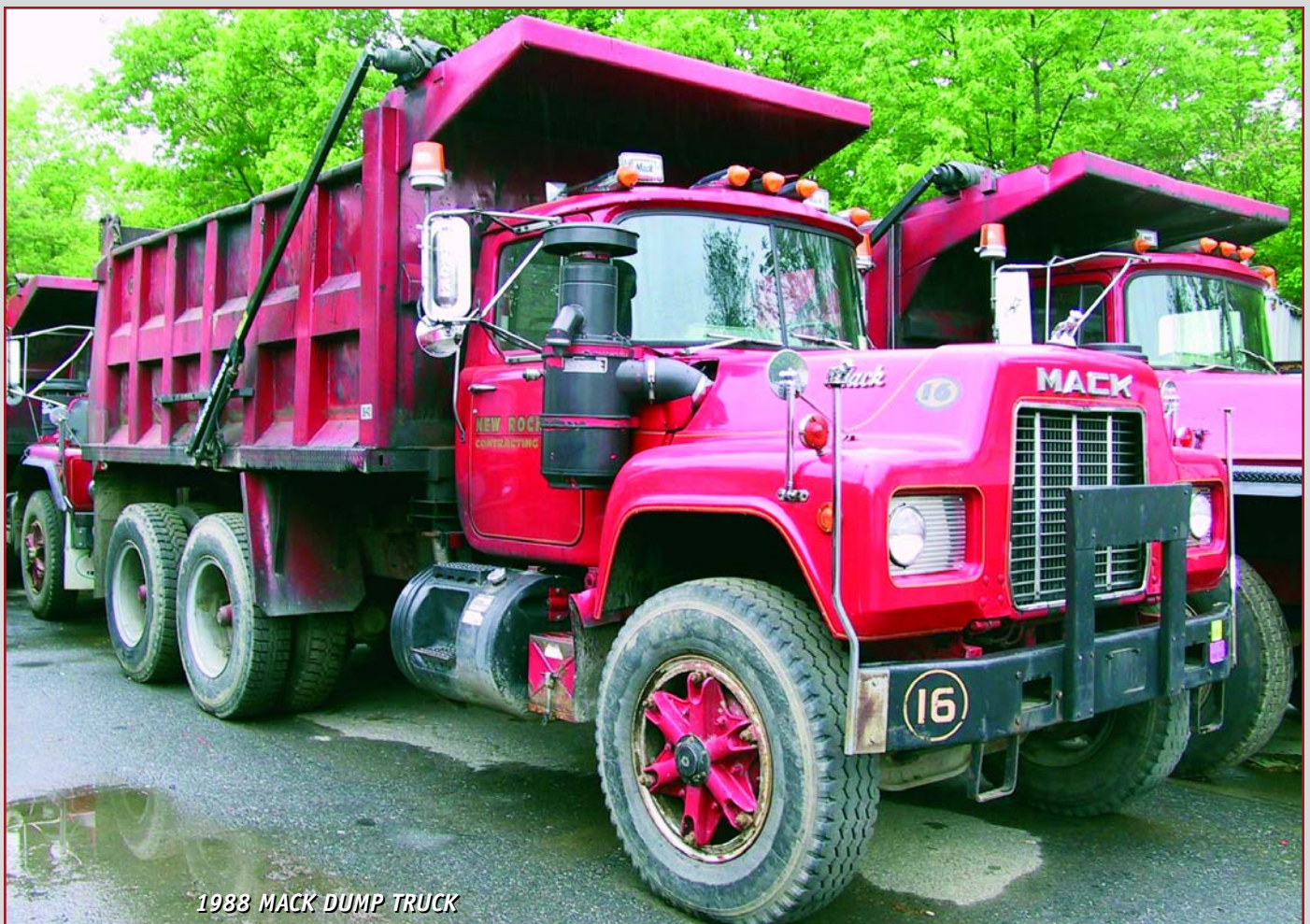
1988 MACK DUMP TRUCK