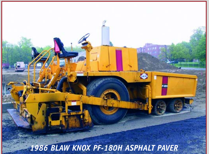
1986 BLAW KNOX PF-180H ASPHALT PAVER

IMPORTANT NOTICE: THE INFORMATION DESCRIBED IN THIS BROCHURE IS CORRECT TO THE BEST OF OUR KNOWLEDGE BUT WE CANNOT GUARANTEE SAME. IT IS FOR THIS REASON THAT BUYERS SHOULD AVAIL THEMSELVES OF THE OPPORTUNITY FOR INSPECTION PRIOR TO THE SALE.