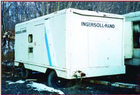
I.R. AIR COMPRESSOR