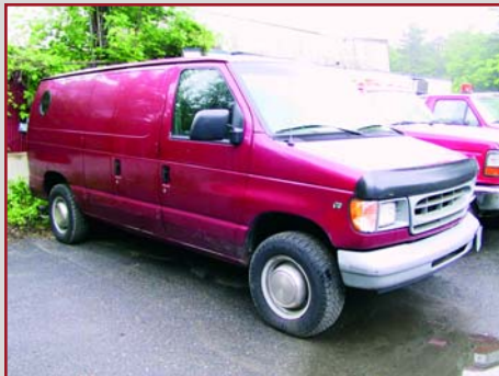
1998 FORD CARGO VAN

ASS'T OFFICE FURNISHINGS INCLUDING: DRAFTSMAN DESK, EXEC. DESK & CREDENZA, FILE CABINETS, COPIER, ETC., ETC. •