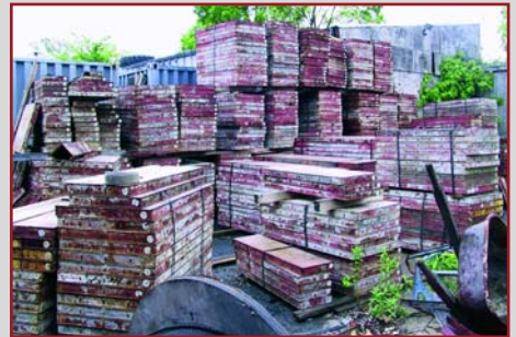
SYMONDS CONCRETE FORMS