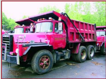
1985 MACK DUMP TRUCK