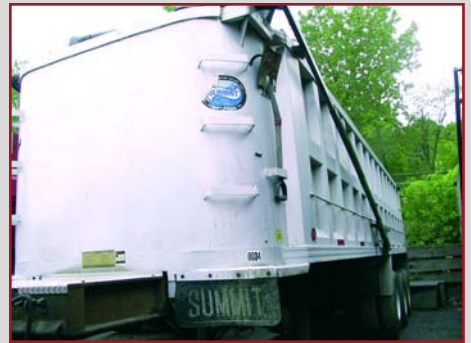
1989 SUMMIT 28' TRAILER DUMP