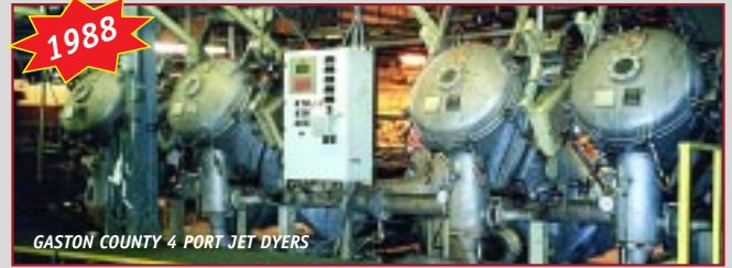
GASTON COUNTY 4 PORT JET DYERS