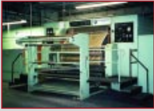
BIELLA FULL DECATUR