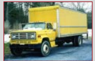
1987 GMC TRUCK