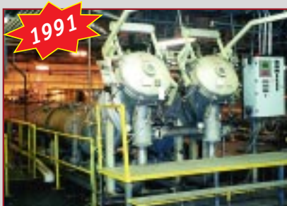
GASTON COUNTY 2 TUBE JET DYER