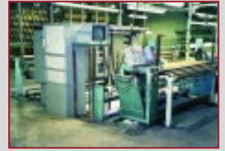
INSPECTION MACHINE w/ WEFT STRAIGHTENER