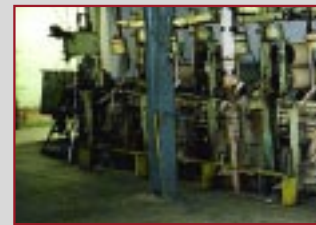
RIGGS & LAMBARDO CRAB