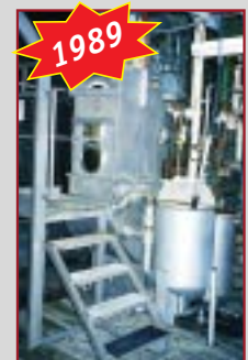
TESSINOX JET DYER (1 of 2)