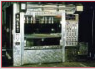
OMERT FULLING MACHINE (1 of 2)