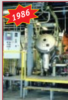
GASTON COUNTY 1 PORT JET DYER