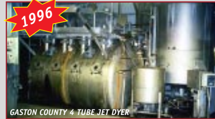
GASTON COUNTY 4 TUBE JET DYER