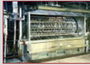
RIGGS & LOMBARDO DYE BOX