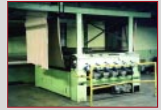
GESSNER SANDING MACHINE