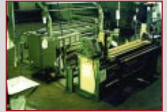
INSPECTION MACHINE w/ WEFT STRAIGHTENER