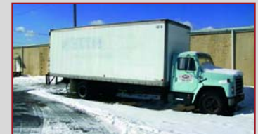
I.H. BOX TRUCK