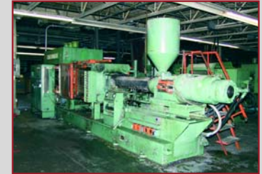
CINCINNATI 350 TON