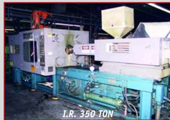
I.R. 350 TON