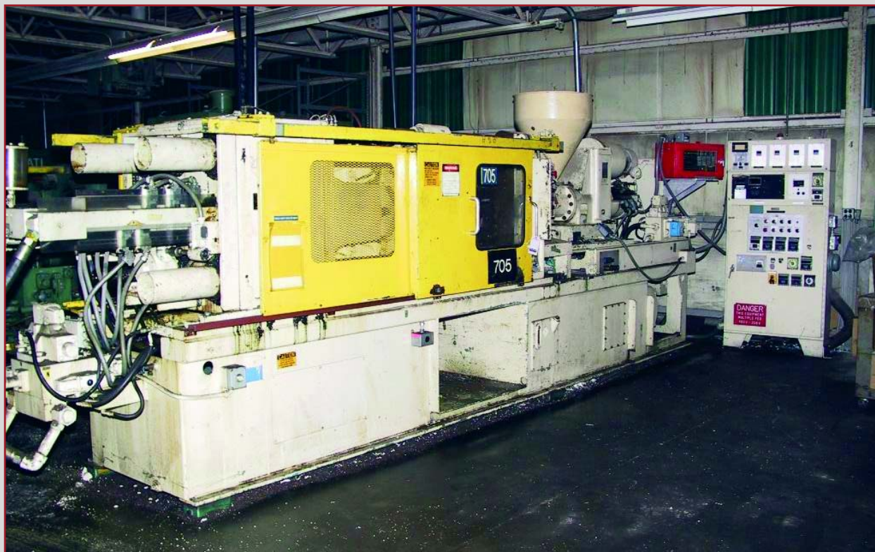
NEW BRITAIN 75 TON INJECTION MOLDING MACHINE

INSPECTION: MORNING OF SALE – 8:30 A.M TO 11:00 A.M.