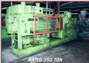
NATCO 350 TON