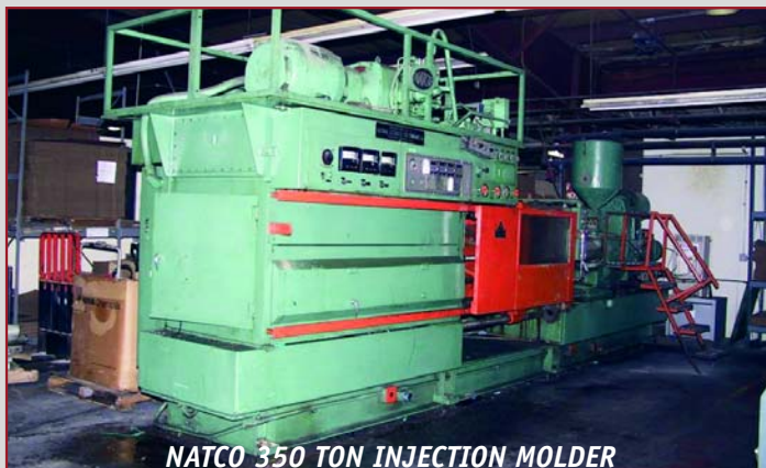
NATCO 350 TON INJECTION MOLDER