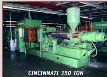
CINCINNATI 350 TON