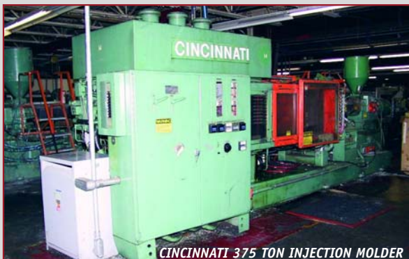
CINCINNATI 375 TON INJECTION MOLDER