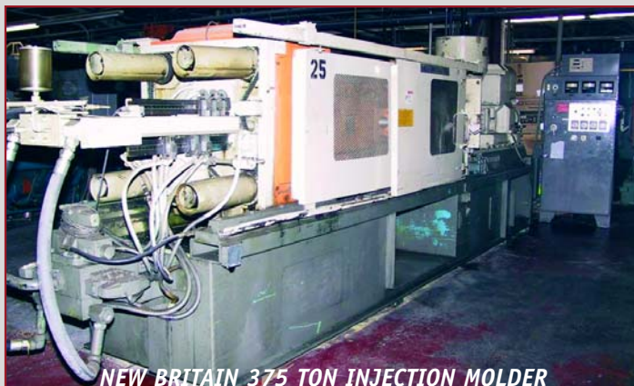
NEW BRITAIN 375 TON INJECTION MOLDER