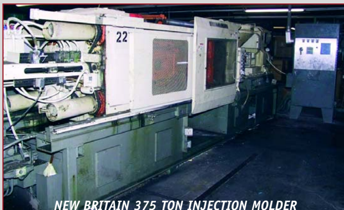
NEW BRITAIN 375 TON INJECTION MOLDER

THE INFORMATION DESCRIBED IN THIS BROCHURE IS CORRECT TO THE BEST OF OUR KNOWLEDGE BUT WE CANNOT GUARANTEE SAME. IT IS FOR THIS REASON THAT BUYERS SHOULD AVAIL THEMSELVES OF THE OPPORTUNITY FOR INSPECTION PRIOR TO THE SALE.