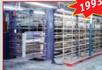
HACOBA SUCKER/MULLER CREEL