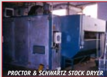
PROCTOR & SCHWARTZ STOCK DRYER