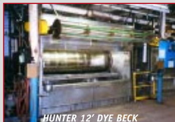
HUNTER 12' DYE BECK