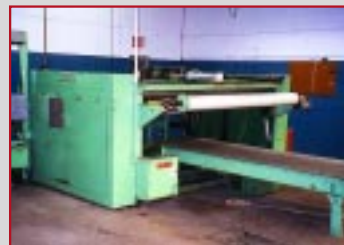
CURTIS-MARBLE POLY WRAPPER