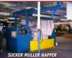
SUCKER MULLER NAPPER