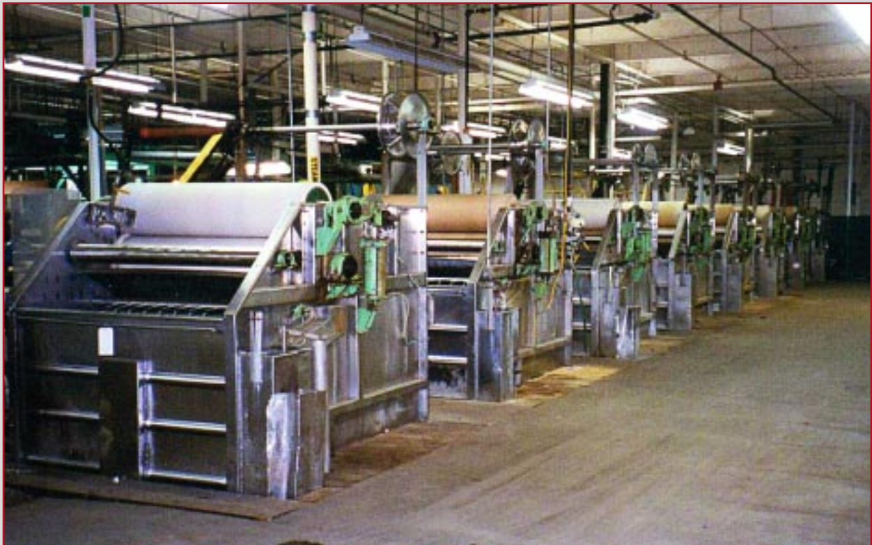
RIGGS & LOMBARD ROPE WASHER

INSPECTION: MONDAY, DECEMBER 1 ST - 10:00 A.M. TO 4:00 P.M. MORNING OF SALE - 8:30 A.M TO 11:00 A.M.