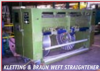
KLETTING & BRAUN WEFT STRAIGHTENER