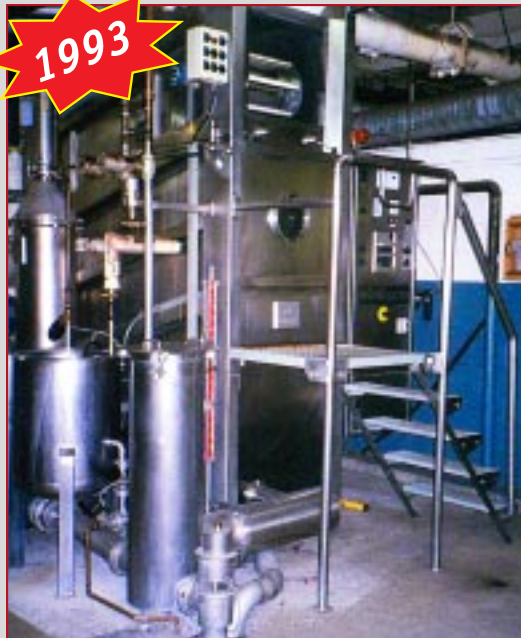
SCLAVOS JET DYE MACHINE