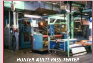
HUNTER MULTI PASS TENTER