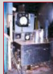
VENANGO SAMPLE DYER