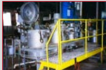
GASTON COUNTY PKG DYER