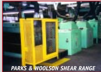
PARKS & WOOLSON SHEAR RANGE