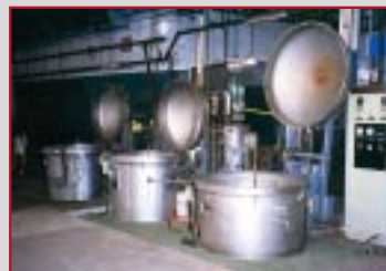
GASTON COUNTY DYE KEIRS