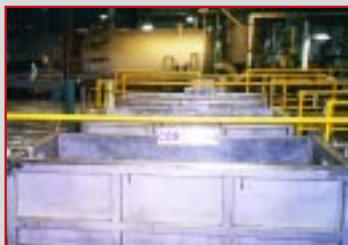
MORTON BEAM DYER