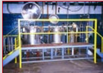
MORTON PKG DYER