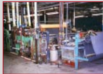
OPEN WIDTH WASHER