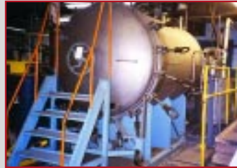
GASTON COUNTY BEAM DYER