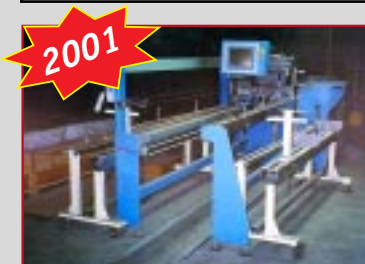
SUPER VEGA WARP-TIE-END MACHINE