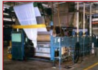
ARLINGTON 4 BOWL CRAB