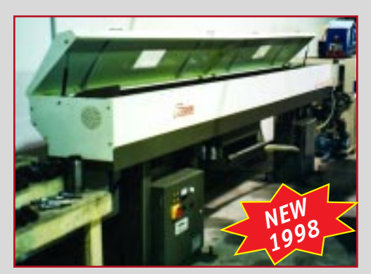
FEDEK MINI SWISS BAR FEED