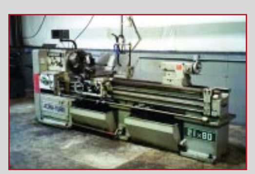
ACRA-TURN 21" X 80" LATHE