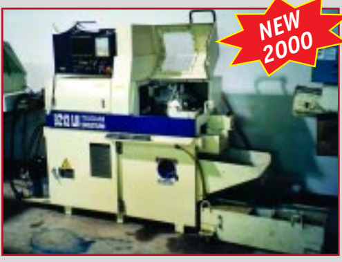
TSUGAMI CNC AUTO LATHE

Konica 1590 Copier • 2/ P.C.'s w/ Monitors & Keyboards • HP DeskJet 550C Printer • Brother 1250 Fax • Desks, Chairs, File Cabinets, Etc. •