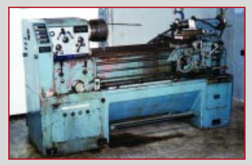
VICTOR 1640 LATHE