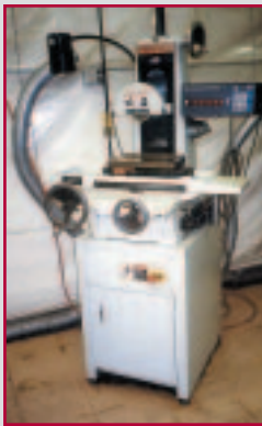
HARIG SURFACE GRINDER