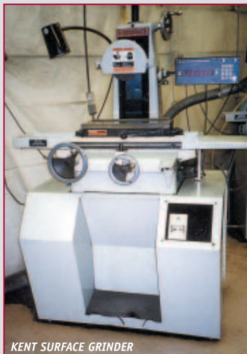
KENT SURFACE GRINDER