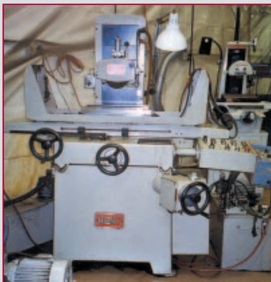
KENT SURFACE GRINDER KGS-818AHD