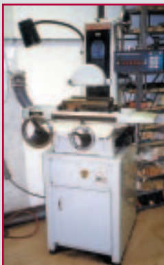
HARIG SURFACE GRINDER