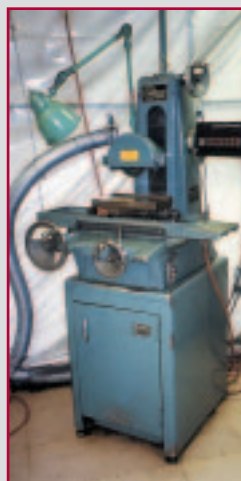
HARIG SURFACE GRINDER