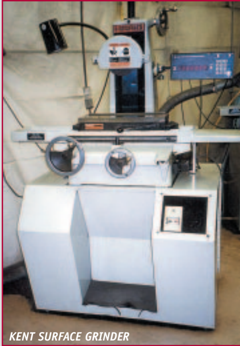
KENT SURFACE GRINDER