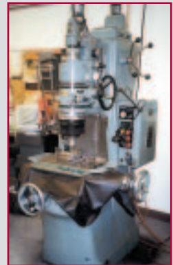
MOORE JIG GRINDER