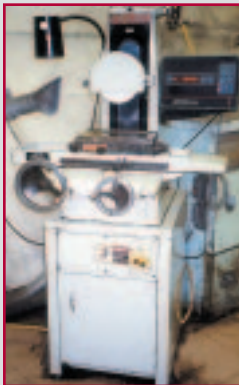
HARIG SURFACE GRINDER