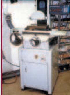
HARIG SURFACE GRINDER