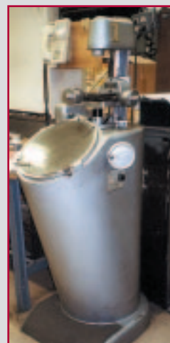
14" OPT. COMPARATOR