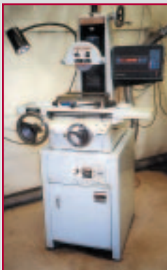
HARIG SURFACE GRINDER