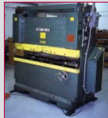
BETENBENDER PRESS BRAKE