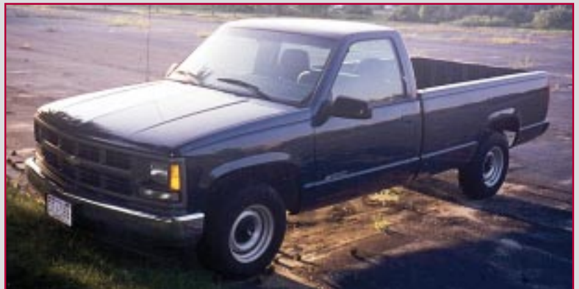
1998 CHEVROLET C1500 PICKUP TRUCK