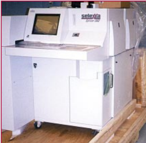
SELEXXO FILM SPLICER