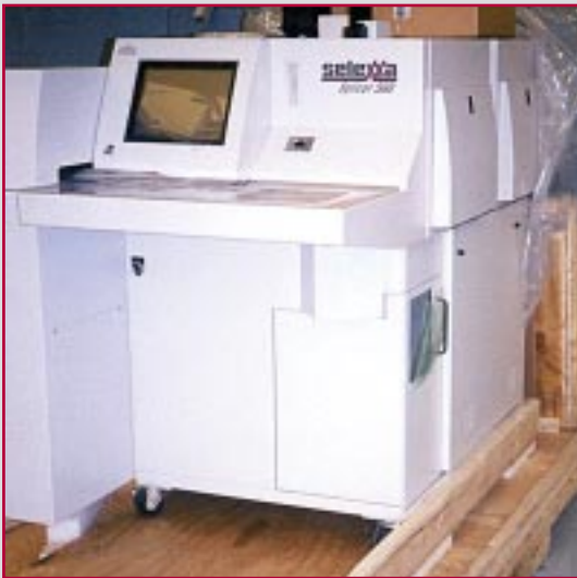
SELEXXA FILM SPLICER

INSPECTION: TUESDAY, SEPTEMBER 16 TH – 10:00 A.M. TO 4:00 P.M. & MORNING OF EACH SALE – 8:30 A.M. TO 10:30 A.M.