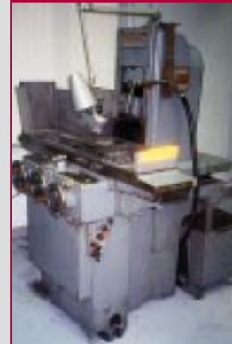
B&S SURFACE GRINDER