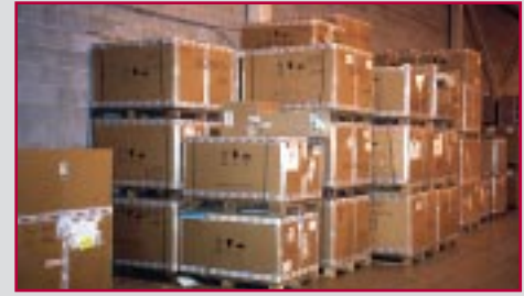
PHOTO FINISHING EQUIPMENT & PARTS INVENTORY