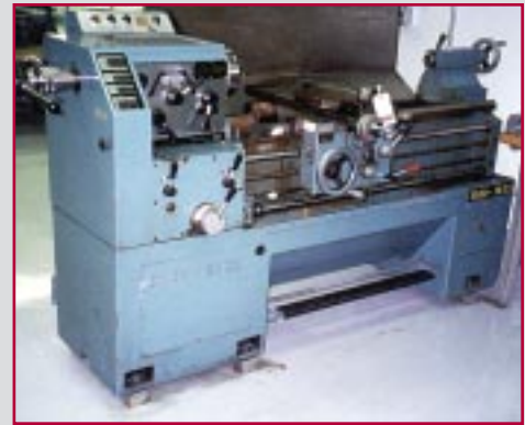
VICTOR ENGINE LATHE