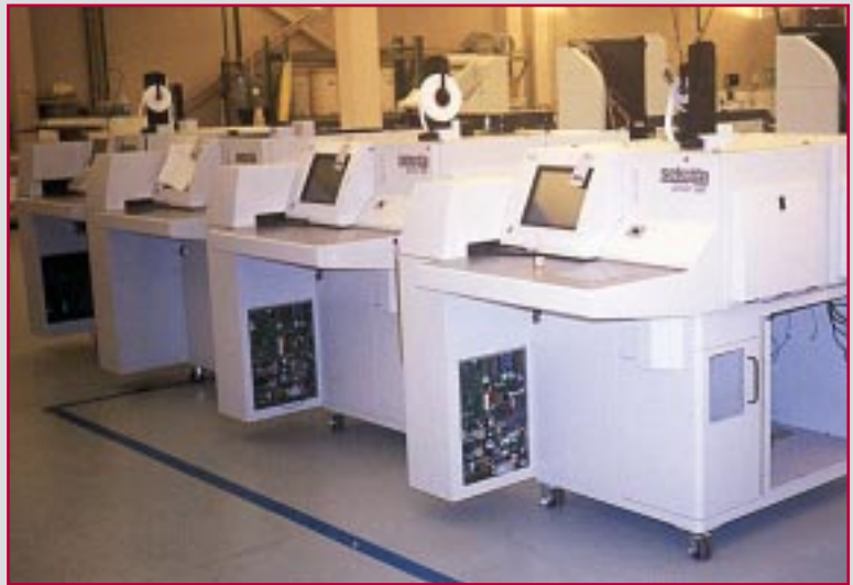
SELEXXA FILM SPLICERS