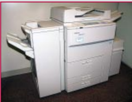
SAVIN 2070DP COPIER