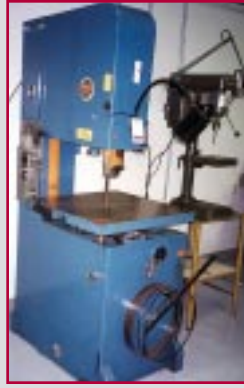
ROLL-IN BAND SAW