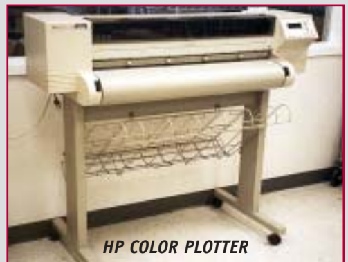
HP COLOR PLOTTER