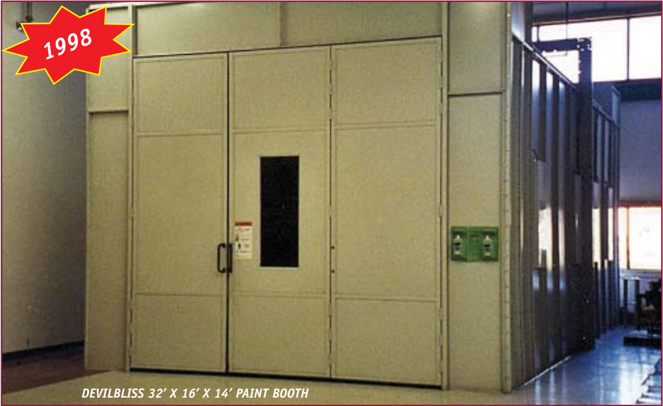
DEVILBLISS 32' X 16' X 14' PAINT BOOTH