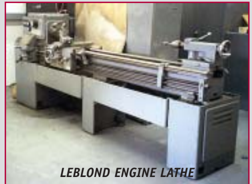
LEBLOND ENGINE LATHE