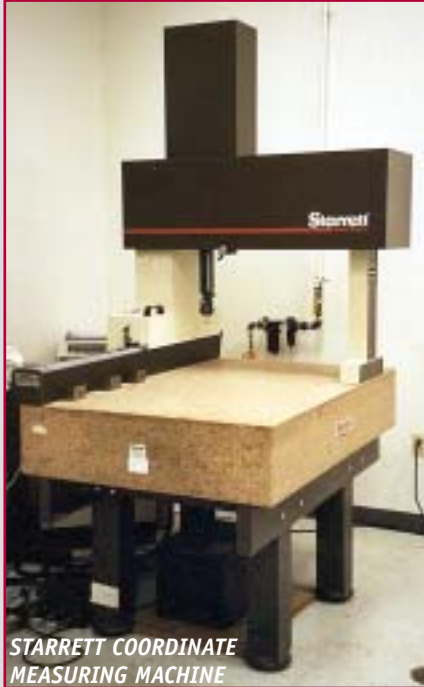
STARRETT COORDINATE MEASURING MACHINE