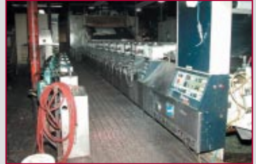
REGGIANI 12 COLOR PRINT MACHINE