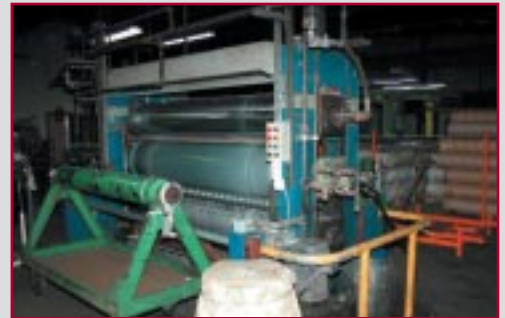
VERDUIN 80" CALENDER