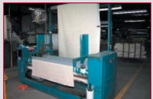
ALEXCO INSPECTION & TUBING MACHINE