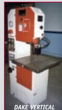
DAKE VERTICAL BANDSAW