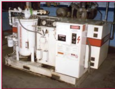
ROTARY SCREW AIR COMPRESSOR