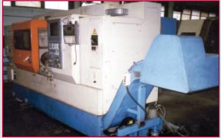
MAZAK SQT-30M CNC TURNING CENTER