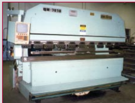
ADIRA PRESS BRAKE