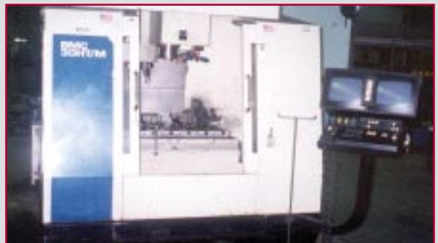
HURCO VERTICAL CNC MACHINING CENTER