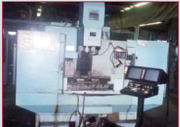
HURCO VERTICAL CNC MACHINING CENTER