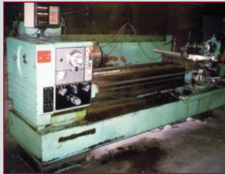
HARRISON ENGINE LATHE