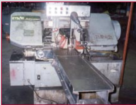
KYSOR METAL BANDSAW