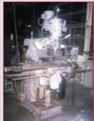
SHARP CNC VERTICAL MILLER