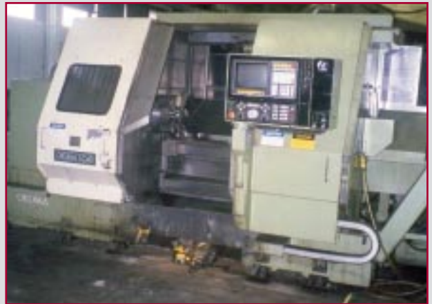
OKUMA LC-40 CNC TURNING CENTER