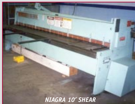
NIAGRA 10' SHEAR