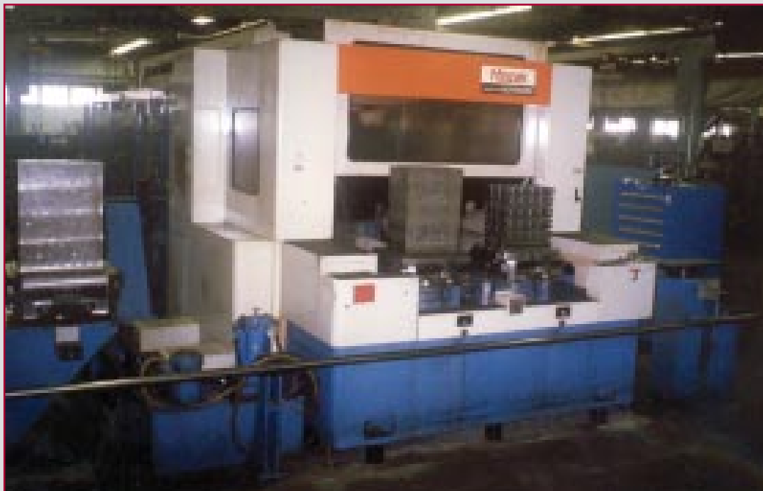
MAZAK ULTRA 550 CNC HORIZONTAL MACHINING CENTER

INSPECTION: TUESDAY, MAY 20 TH – 10:00 AM TO 4:00 PM & MORNING OF EACH SALE – 8:30 AM TO 10:30 AM