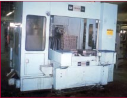
TOYODA HORIZONTAL MACHINING CENTER