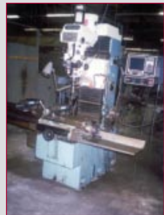
TRAK CNC VERTICAL MILLER

★ Large Qty. Steel & S.S. Stock Round, Flat, Bar & Angle ★