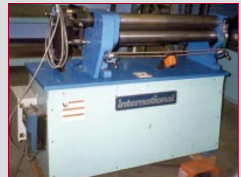
POWER BENDING ROLL