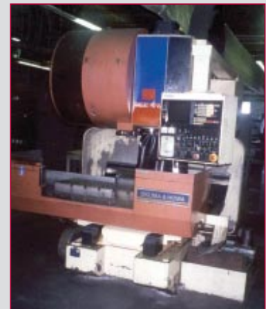
OKUMA & HOWA 4VA CNC MACHINING CENTER