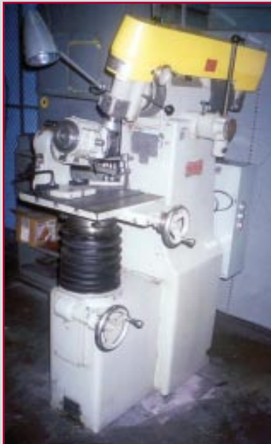
OLIVER TOOL GRINDER