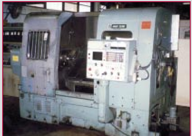
MORI-SEIKI SL-4 CNC TURNING CENTER