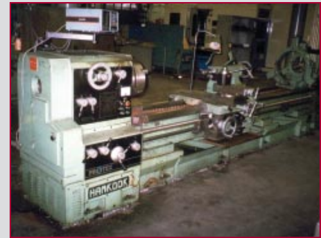
HANKOOK ENGINE LATHE