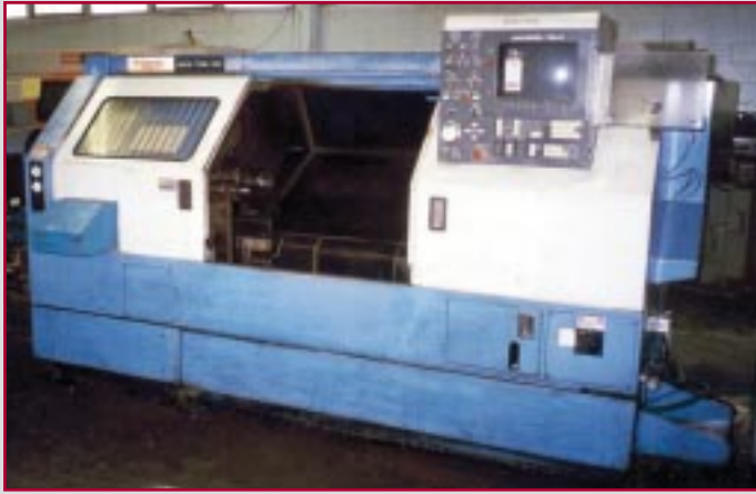
MAZAK QT-28N CNC TURNING CENTER