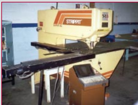
STRIPPIT SUPER AG PUNCH