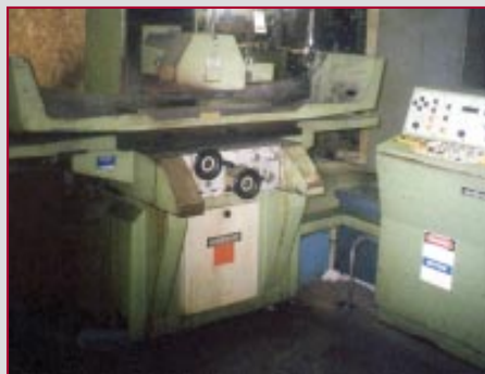
JAKOBSON SURFACE GRINDER