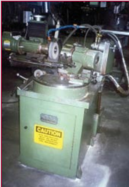
RUSH DRILL BIT SHARPENER