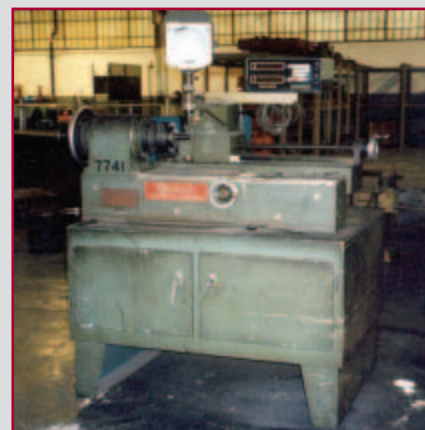
DEVILIEG TOOL SETTER