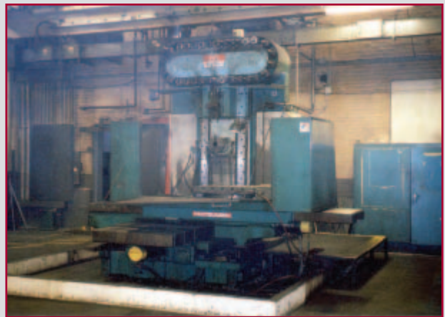
MATSURRA MC-1500H CNC MACHINING CENTER

SALE PER ORDER OF MORTGAGEE & SECURED PARTY DOHERTY, WALLACE, PILLSBURY AND MURPHY, P.C. ONE MONARCH PLACE, SPRINGFIELD, MA ATTORNEYS FOR MORTGAGEE & SECURED PARTY