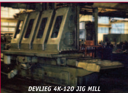
DEVLIEG 4K-120 JIG MILL