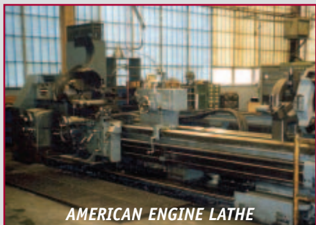
AMERICAN ENGINE LATHE