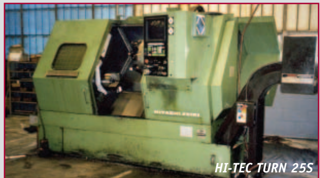
HI-TEC TURN 25S