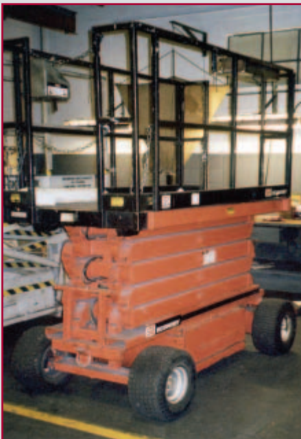
ECONOMY SCISSOR LIFT