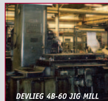
DEVLIEG 4B-60 JIG MILL