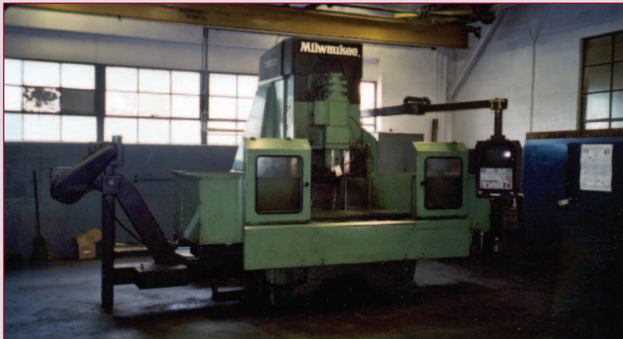
KEARNY & TRECKER VB-4 CNC VERTICAL MACHINING CENTER

INSPECTION: TUESDAY, NOVEMBER 19TH - 9:00 AM TO 4:00 PM & MORNING OF EACH SALE - 8:30 AM TO 10:30 AM