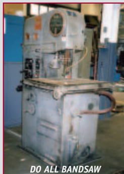
DO ALL BANDSAW