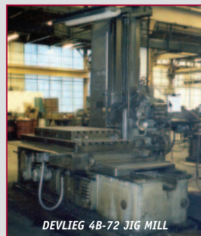
DEVILIEG 4B-72 JIG MILL