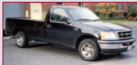
1998 FORD PICK-UP TRUCK