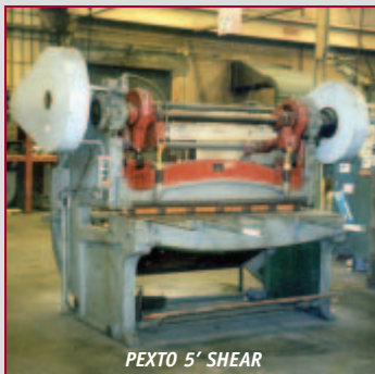
PEXTO 5' SHEAR