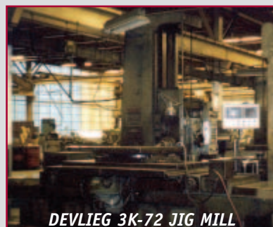
DEVLIEG 3K-72 JIG MILL