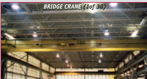
BRIDGE CRANE (1of 30)