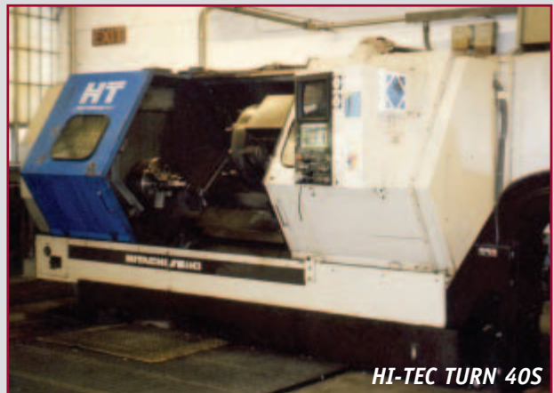
HI-TEC TURN 40S