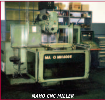
MAHO CNC MILLER