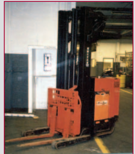
RAYMOND ORDER PICKER