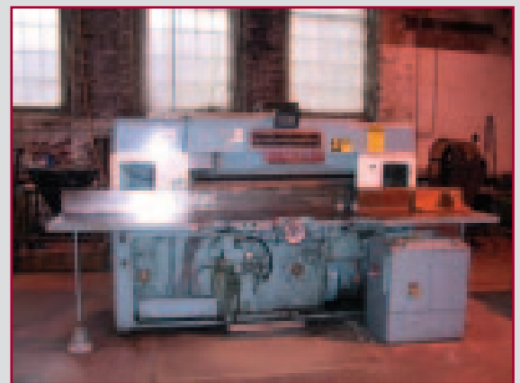
LAWSON PACEMAKER II

IMPORTANT NOTICE: THE INFORMATION DESCRIBED IN THIS BROCHURE IS CORRECT TO THE BEST OF OUR KNOWLEDGE BUT WE CANNOT GUARANTEE SAME. IT IS FOR THIS REASON THAT BUYERS SHOULD AVAIL THEMSELVES OF THE OPPORTUNITY FOR INSPECTION PRIOR TO THE SALE.