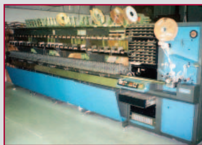
UNIVERSAL COMPONENT SEQUENCER MOD. 259G-R-21900