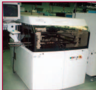
MDM SCREEN PRINTER MOD. AP-25