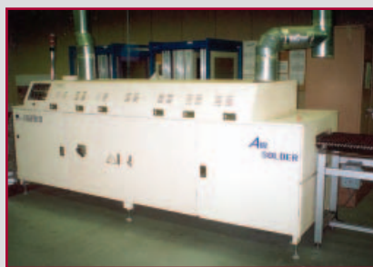
ETC EIGHTECH AIR SOLDER MACHINE MOD. ARS-OLLR