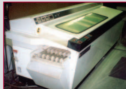
TOOLTRONICS ULTRACLEAN II WASHER