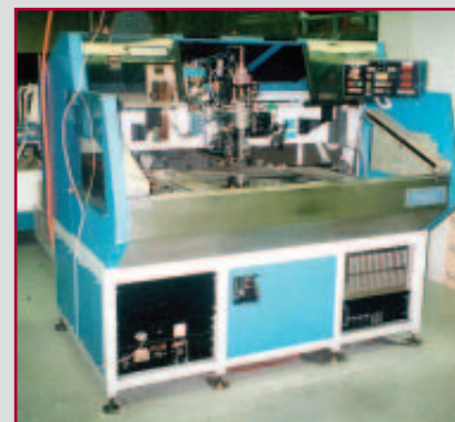
UNIVERSAL RADIAL INSERTER MOD. 6346