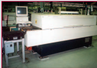
HELLER 1500 OVEN