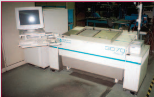
HEWLETT PACKARD IN-CIRCUIT TESTER MOD. 3070