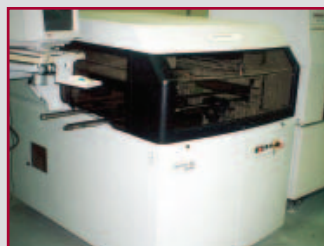
MDM SCREEN PRINTER MOD. AP-17