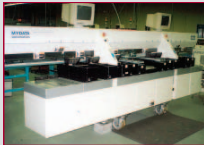
MYDATA SMT PART PLACER MOD. TP-18-UPF