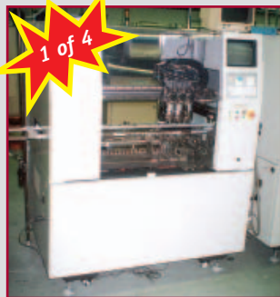
ZEVATECH PART PLACER MOD. FM-710