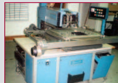
UNIVERSAL VCD INSERTER MOD. 6285