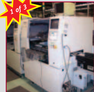
ZEVATECH PART PLACER MOD. FM-720