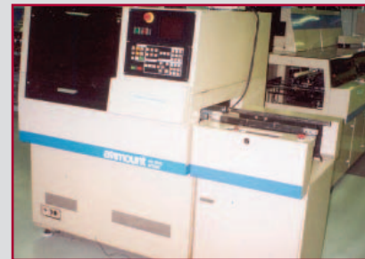
TDK ADHESIVE DISPENSER