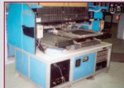
UNIVERSAL DIP INSERTER MOD. 6772