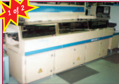
TDK CHIP SHOOTER MOD. RX-5A