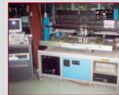
UNIVERSAL DIP INSERTER MOD. 6772