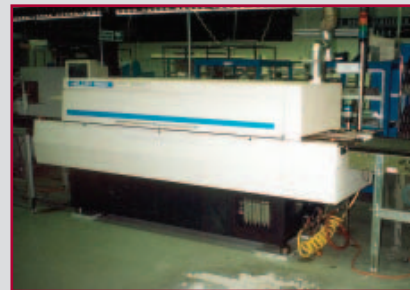
HELLER 1500 OVEN