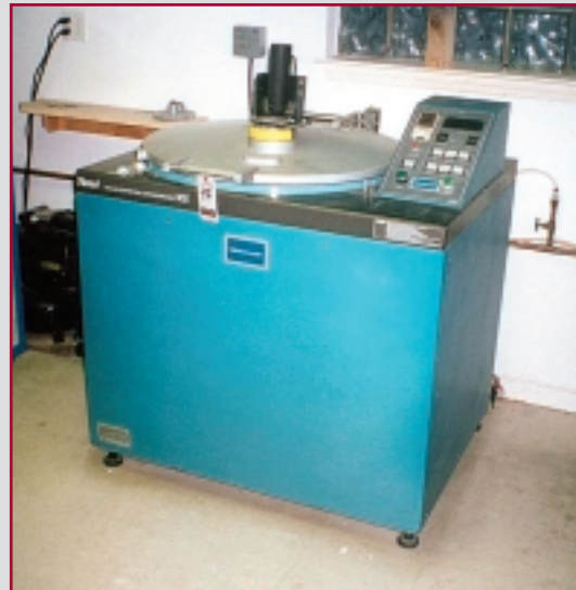
YASUI CASTING MACHINE VCC-11G