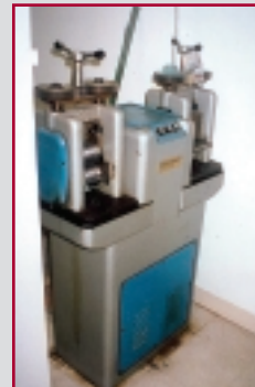
CAVALLIN ROLLING MILL