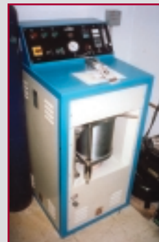
GALLONI CASTING MACH.