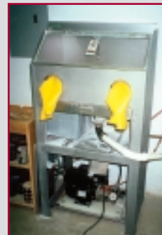
WATER JET CABINET