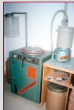
MDM VAC MIXER