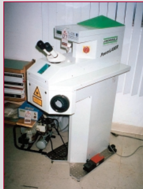
SCHMALZ POWER LASER WELDER

IMPORTANT NOTICE: THE INFORMATION IN THIS BROCHURE IS CORRECT TO THE BEST OF OUR KNOWLEDGE BUT WE CANNOT GUARANTEE SAME. IT IS FOR THIS REASON THAT BUYERS SHOULD AVAIL THEMSELVES OF THE OPPORTUNITY FOR INSPECTION PRIOR TO THE SALE.